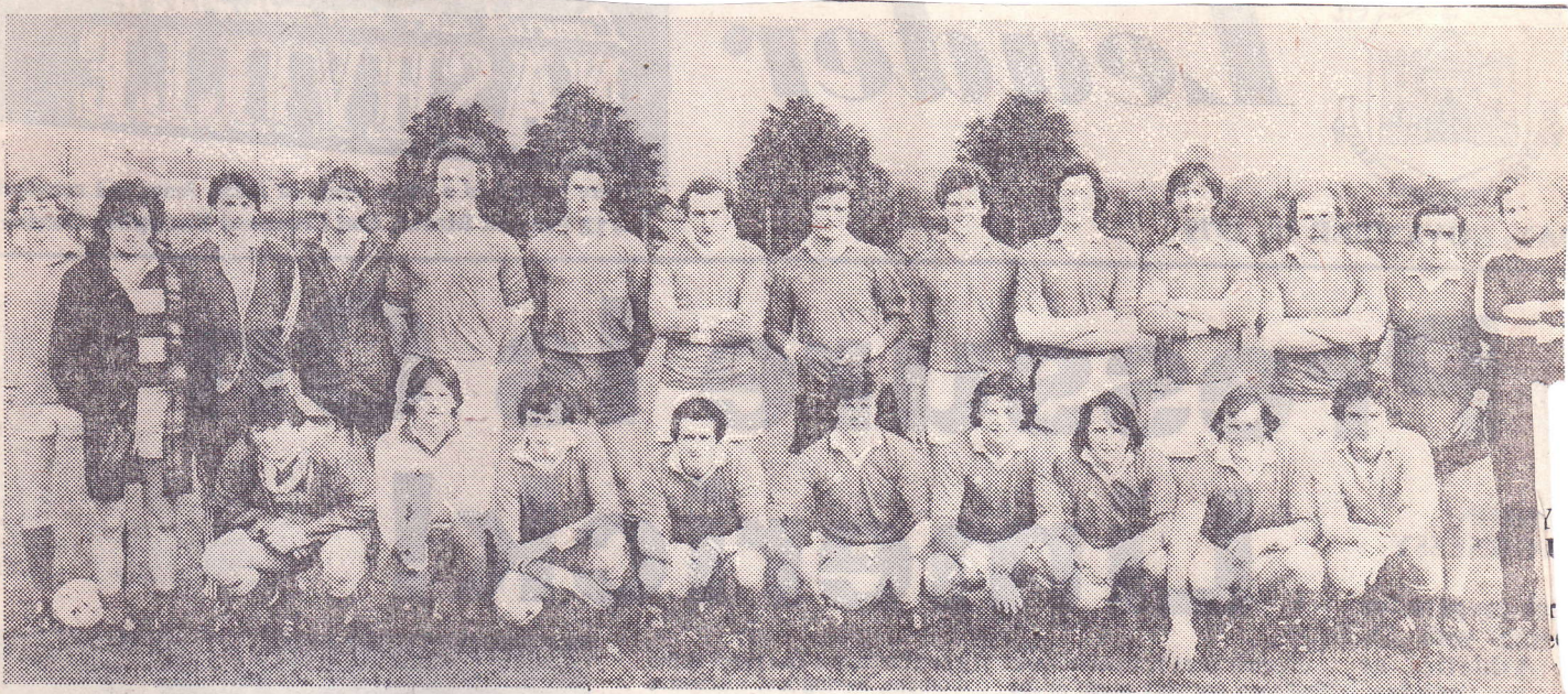
Monaleen (top) who beat Askeaton (below) in the county under-21 football final.