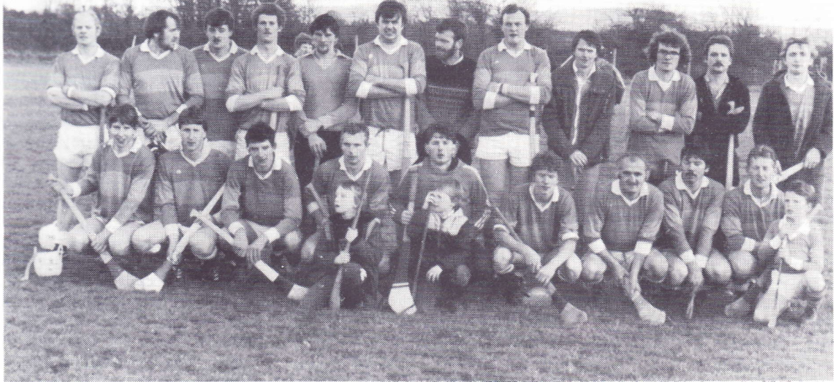
Askeaton Junior Hurlers and subs who beat Feoghanagh in West Semi-Final, 4-7 to 0-6