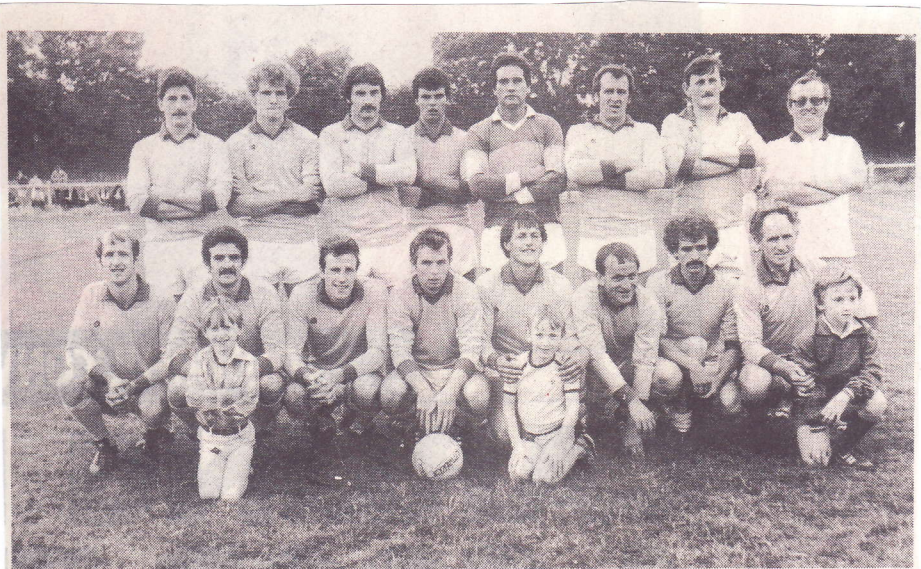
Askeaton (title holders) who drew with St. Kieran's, 1-7 to 0-10, in the West senior football final at Newcastle West on Saturday evening.