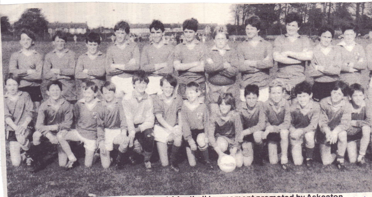
Askeaton winners of the under 14 football tournament promoted by Askeaton G.A.A. club last weekend.