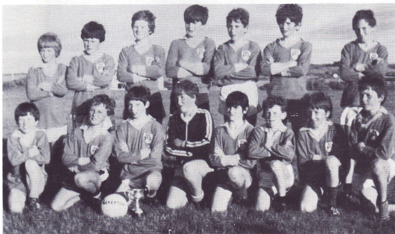
Askeaton U/12 Football - West Champlons 1984

Which green and gold will wave tonight, who knows. Will Nearys Pub to night be celebrating Or will the Western cup remain where bright Deel water flows Will we hail a triple timer in 'Askayton'.