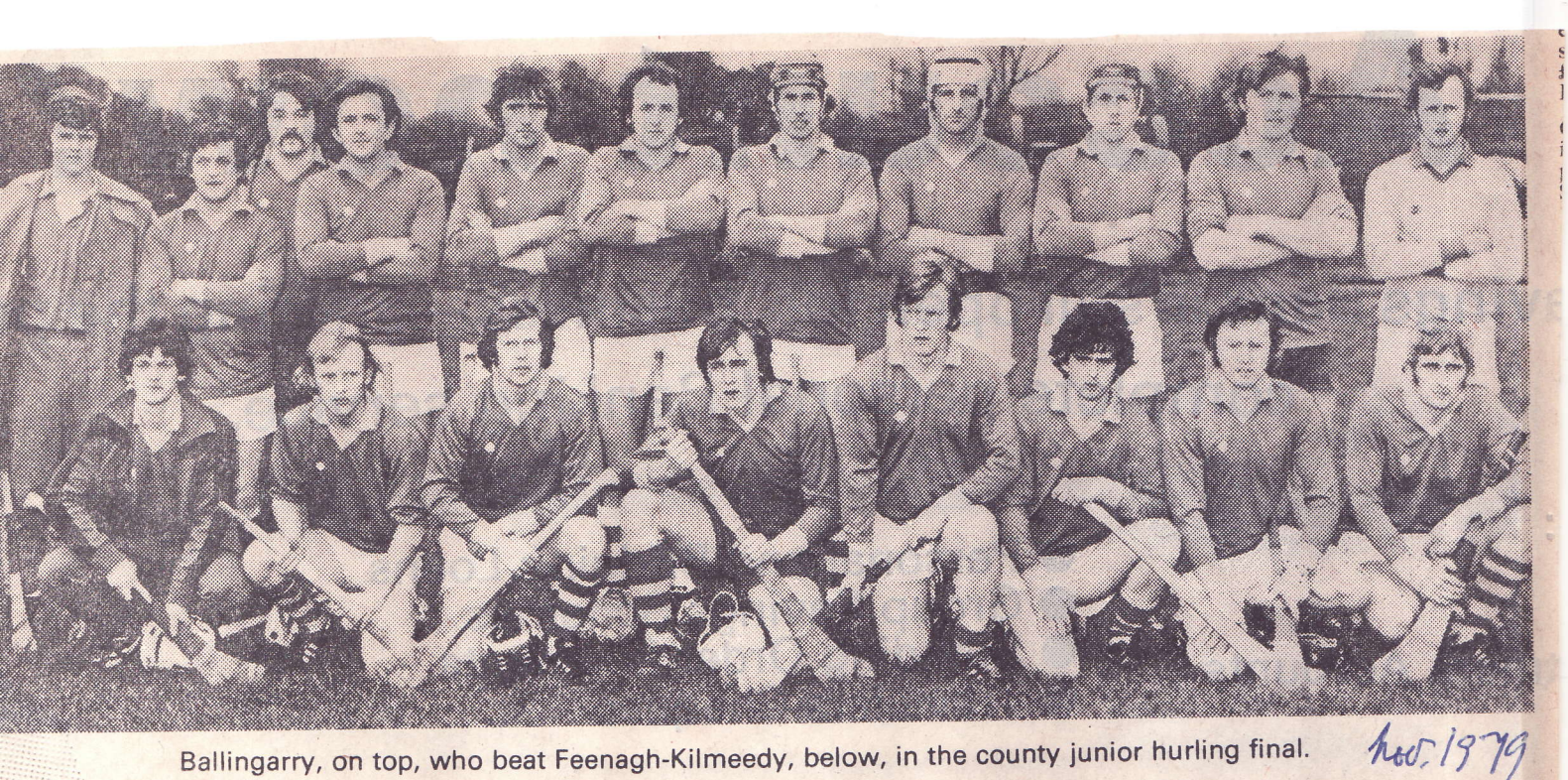
Ballingarry, on top, who beat Feenagh-Kilmeedy, below, in the county junior hurling final.