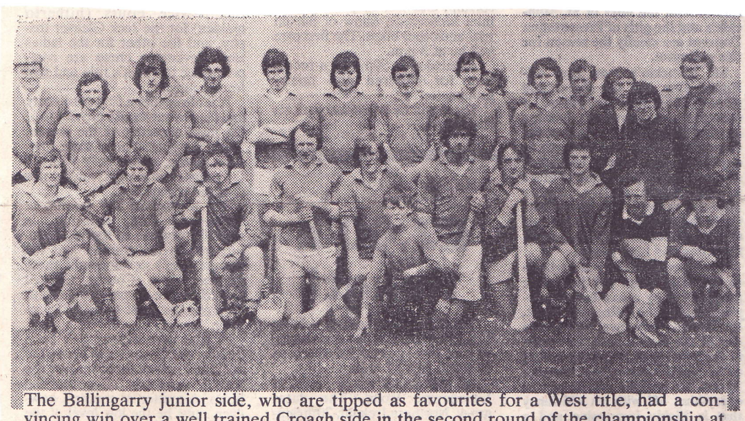
The Ballingarry junior side, who are tipped as favourites for a West title, had a convincing win over a well trained Croagh side in the second round of the championship at Rathkeale on Sunday. 3-6-48