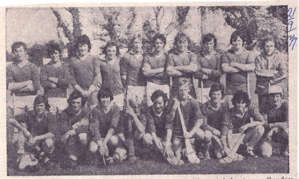
The Ballingarry under 21 side that lost to Newcastle West at Askeaton on Sunday.