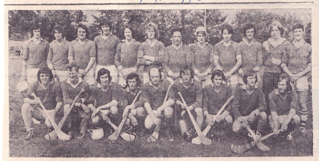
Ballingarry junior hurlers, who lost to Ardagh in the quarter-finals of the West Limerick Championship at Newcastle West.