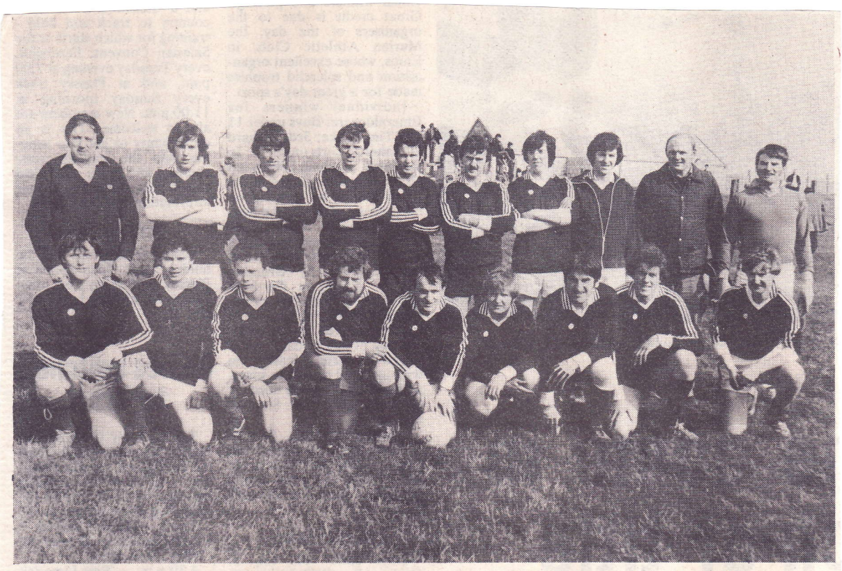
Ballysteen, defeated by Castlemahon in the 1979 Junior Football at Rathkeale on Sunday.