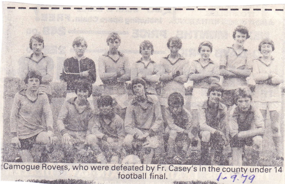
Camogue Rovers, who were defeated by Fr. Casey's in the county under 14: football final. 1-9-79