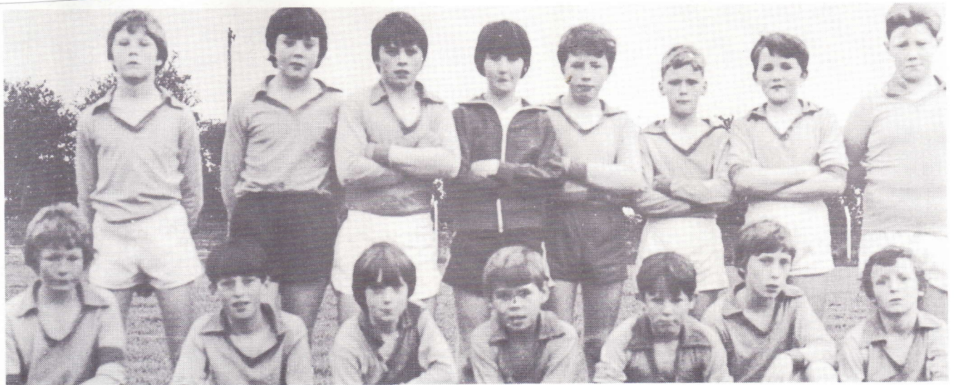
This Camogie Rover (Bruff-Meanus) side won both the South Limerick Hurling and Football Championship Under-12, with the same fifteen boys.