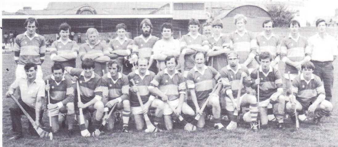
Camogue Rovers Novice Hurling Team 1984