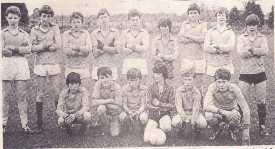
Camogue Rovers team, who failed to Cloughaun in the county under 14 football final.