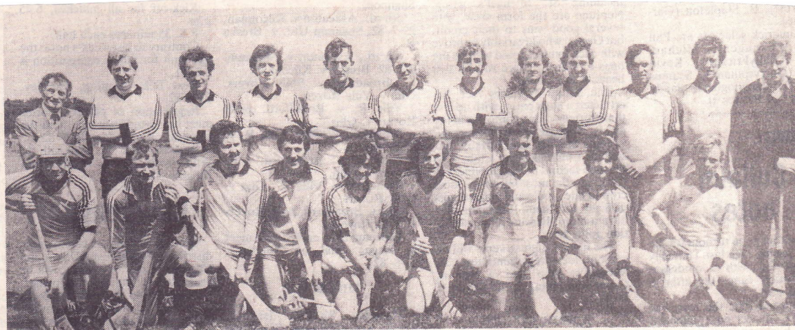
Croagh-Kilfinny, who lost to Feenagh-Kilmeedy. 3-7-82