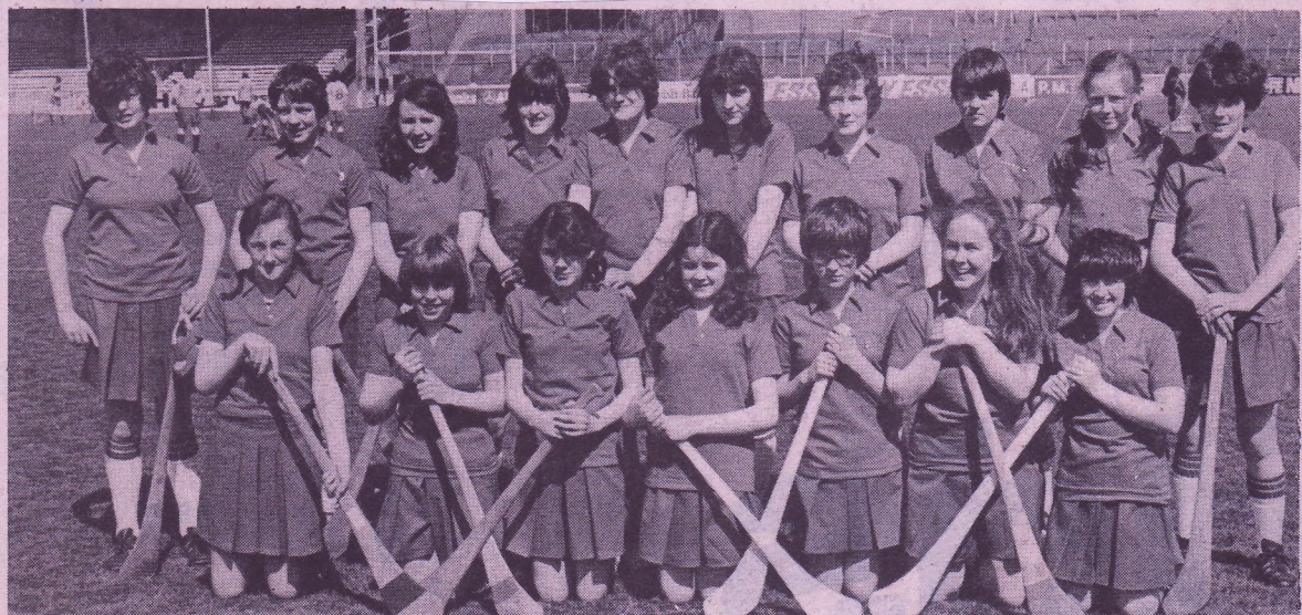
May 80 Presentation De La Salle, Hospital, who failed to Maryfield College in the camogie colleges junior final at Croke Park on Saturday.