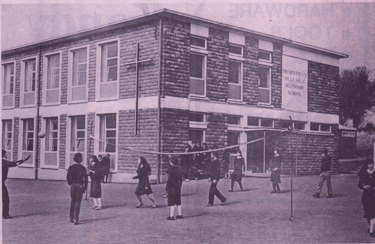
Games in progress at Hospital.

In the Limerick Colleges the school had an historic win in the under-16 hurling, defeating Sexton Street II in the Sean Jones Cup and later accounting for Ardscoil Ris in the under 16 football to retain the O'Neill Cup. The under 18