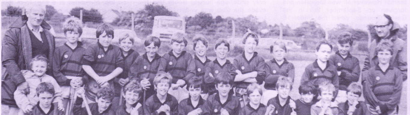
HOSPITAL/HERBERTSTOWN, SOUTH U/12H. CHAMPIONS

Encouragement to the under 12 teams in the years ahead, will guarantee the future of Gaelic games in Hospital and Herbertstown.