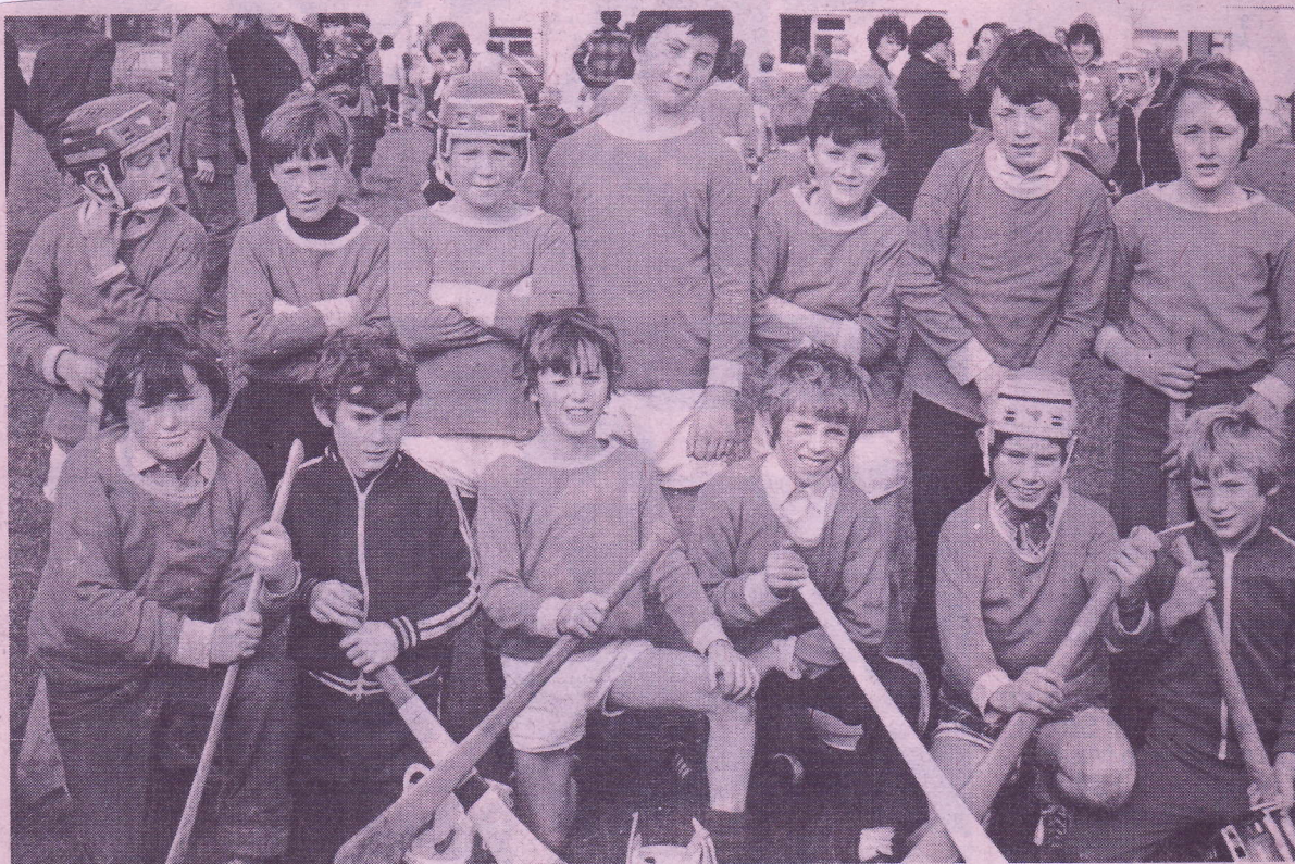
Herbertstown-Lough Gur, defeated by Athlaccas in Division 3, South Primary Schools final.