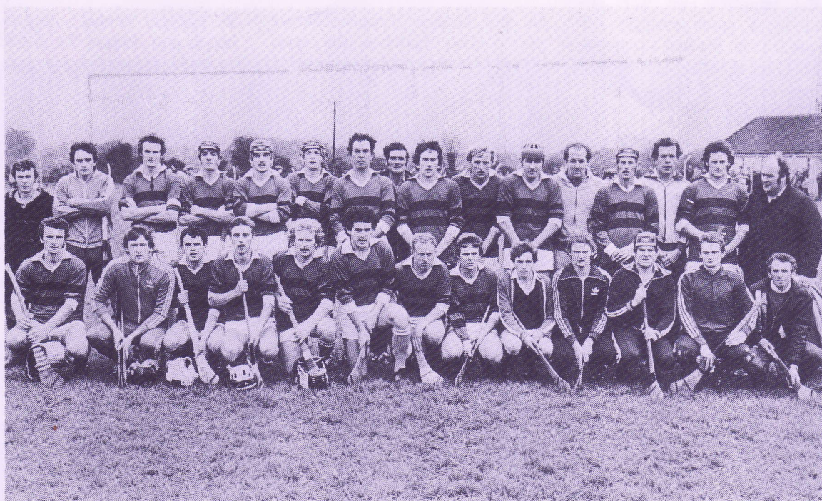
Hospital/Herbertstown - County Junior Hurling Champions 1983