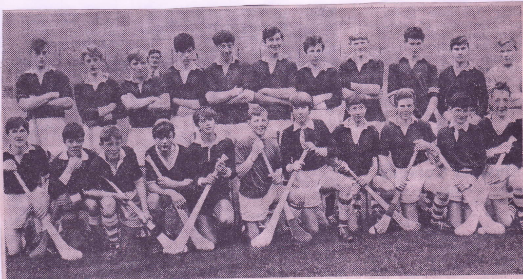
The Herbertstown juvenile hurling team which won the South Limerick championship in 1969. They later failed by two points to Balling...