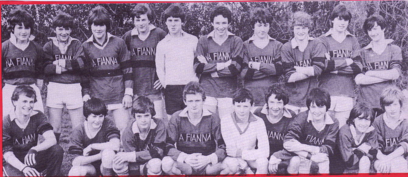
NA FIANNA SOUTH UNDER-16 FOOTBALL CHAMPIONS. 1980