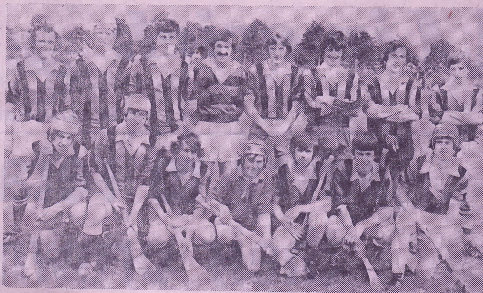
Glenroe, South Limerick under-21 hurling champions.