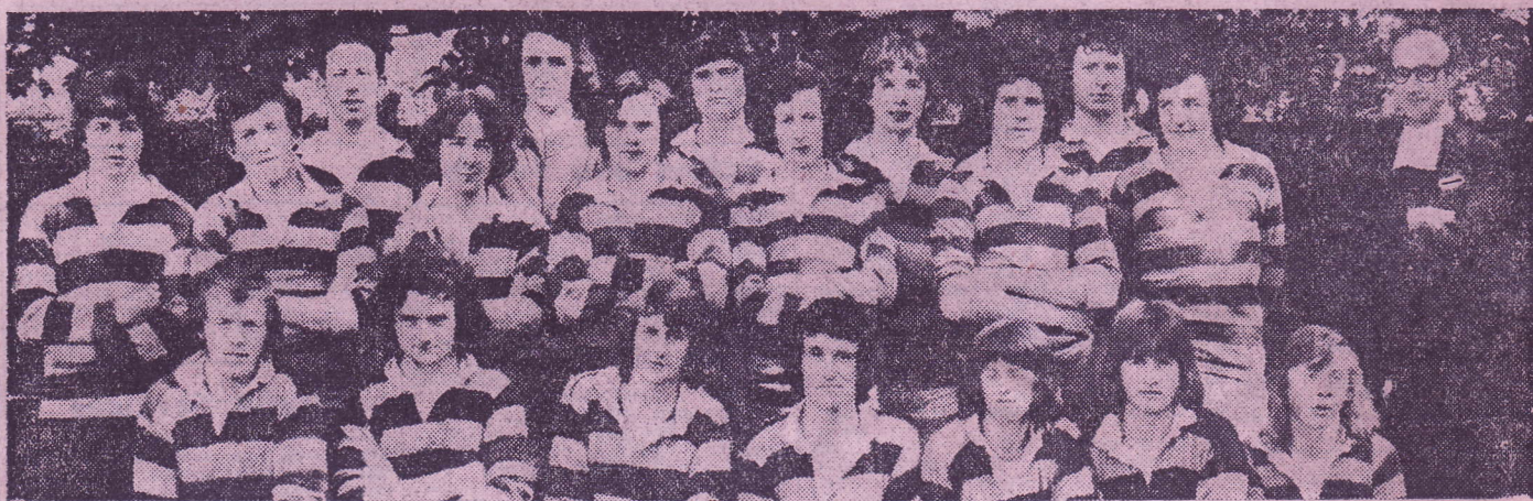
Presentation De La Salle Hospital, under 19 Munster football champions (Corn an Rúnaí). Front row (l. to r.)