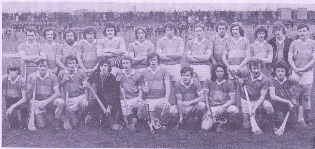
THE 'WELL SENIOR HURLERS: LEADERS OF LIMERICK HURLING ONCE AGAIN.

If one were to take an analytical look at Patrickswell Senior hurling since 1970, one would discover that they have been involved in the final "shake up" in almost every season. The 1977 County final was their fourth appearance in