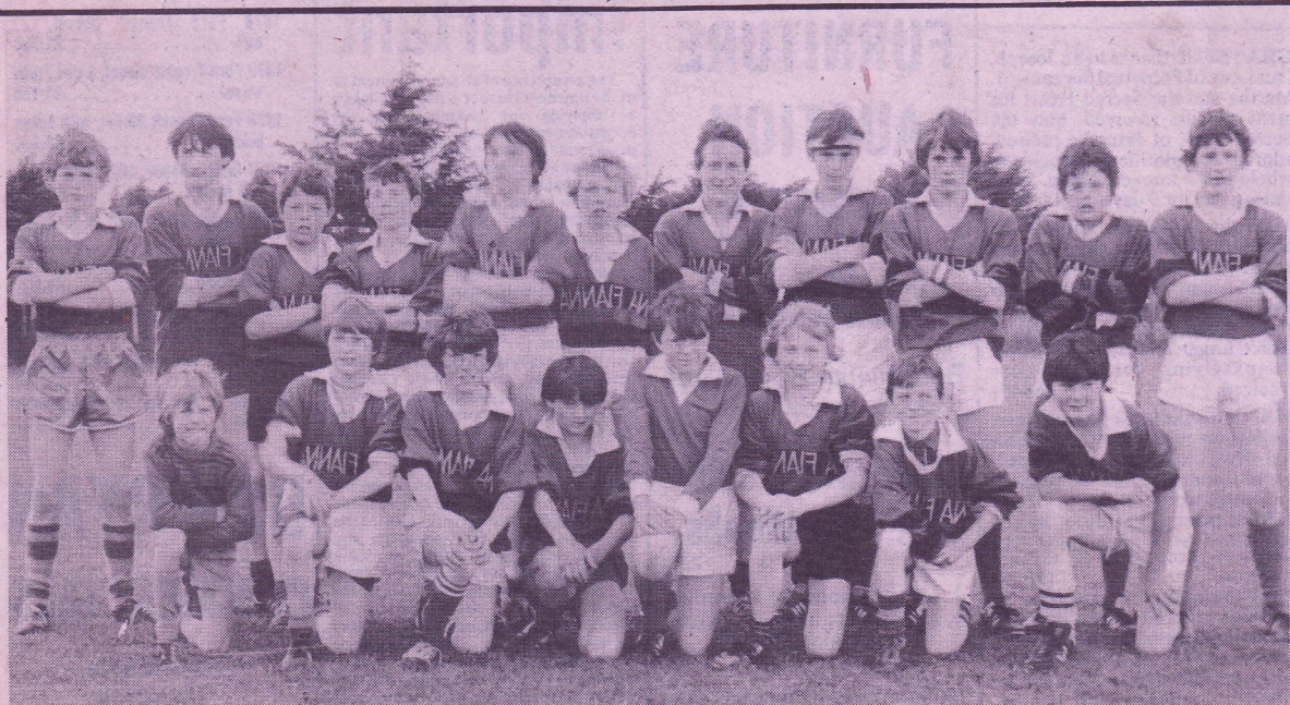
May 80 The Camogie Players defeated by Camogie Players in the South Under 14 F.C. final