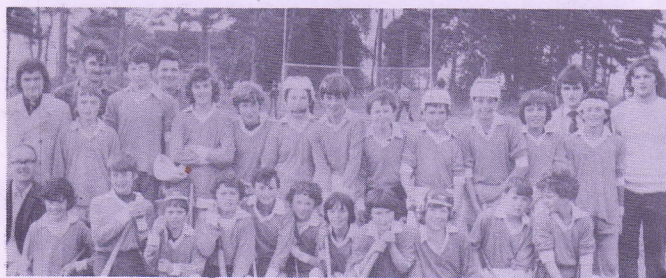
Banogue U-14 hurling team, who reached the South final for the first time in 1977.