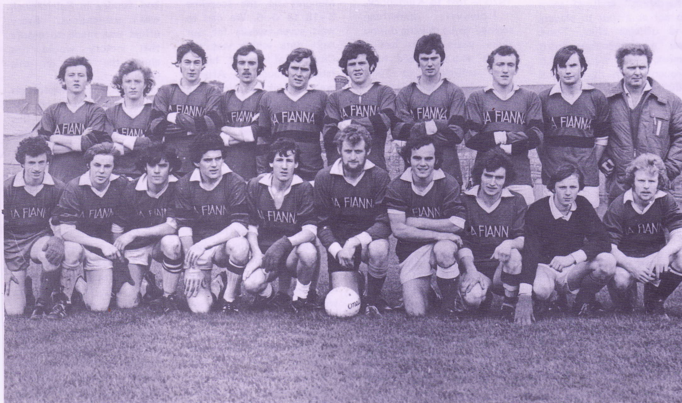
NA FIANNA U-21 FOOTBALL TEAM WHICH RETAINED THEIR COUNTY TITLE: