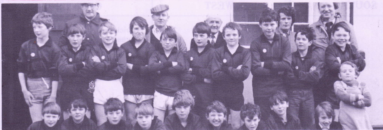
HOSPITAL/HERBERTSTOWN UNDER 12 FOOTBALL TEAM