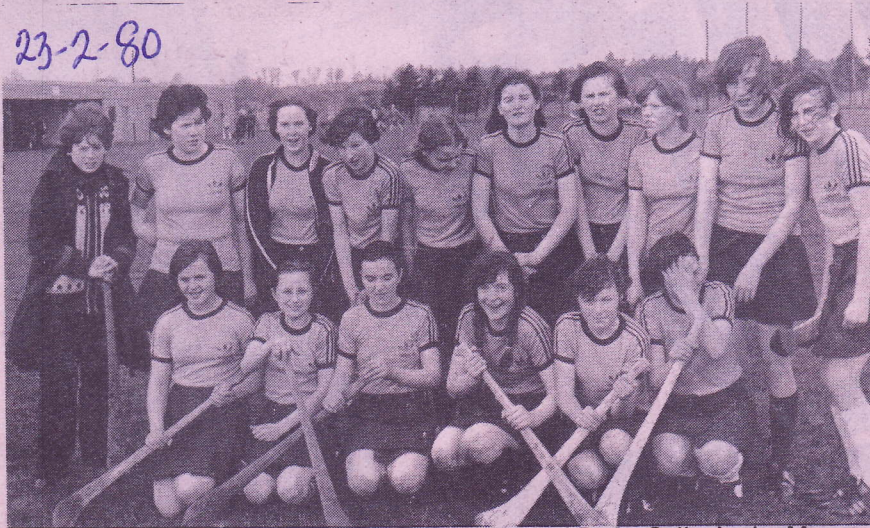
St. Joseph's, Tulla, who were defeated by Hospital De La Salle, in the Munster Junior Colleges final.