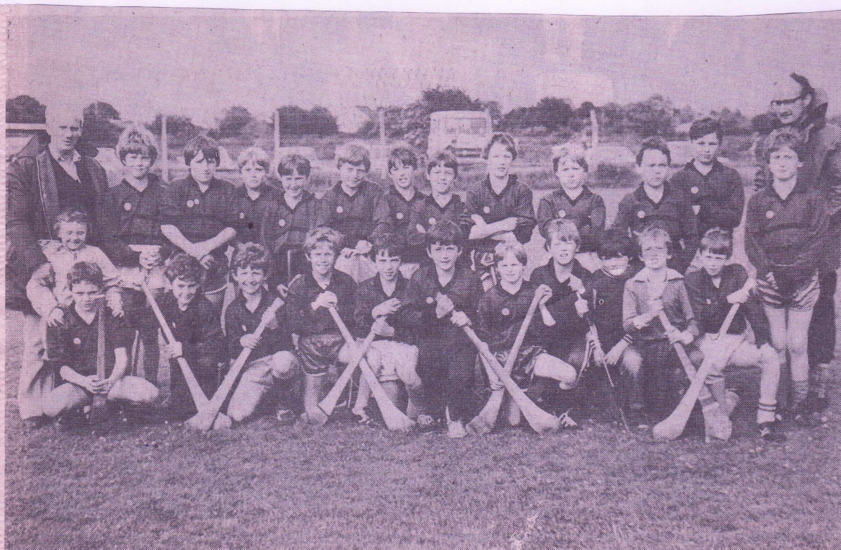
Hospital/herbertstown, who defeated Kilmallock in the South U-12, H.C. final at Knocklong.