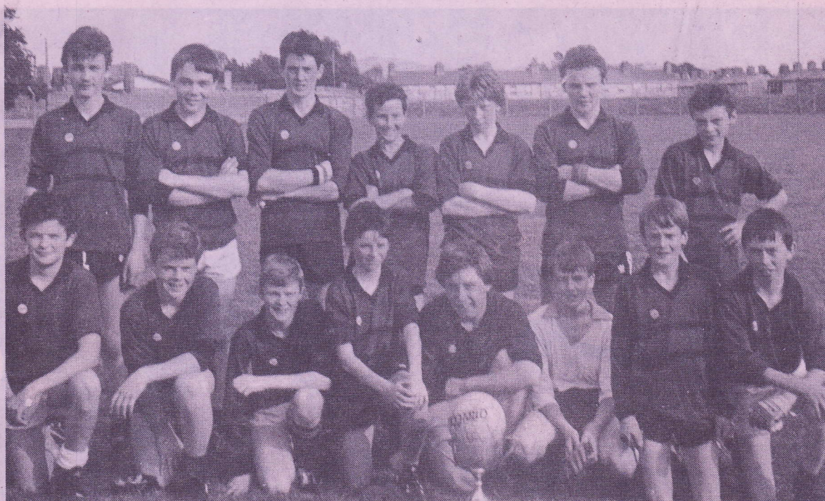
The Hospital-Herbertstown team who won the county 14 football title for the first time.

LIMERICK LEADER, SATURDAY, SEPTEMBER 27, 1986.