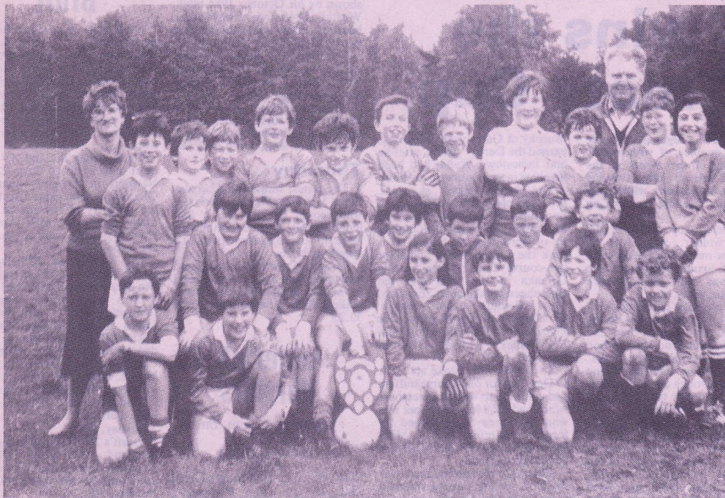
The Herbertstown team who won the South Limerick primary schools' Div. II football final.

LIMERICK LEADER, SATURDAY, SEPTEMBER 27, 1986.