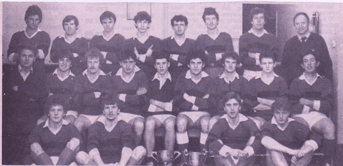
The Hospital-Herbertstown team who won the 1983 Limerick county junior football championship. The club