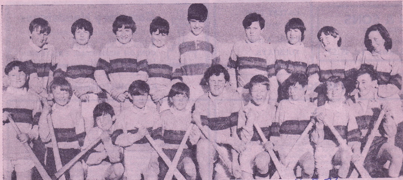
Na Fianna, Hospital, under 14 hurling team. 26-5-73