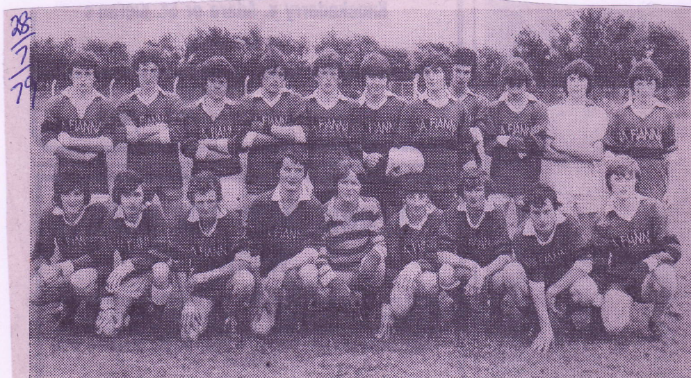
Na Fianna, who failed to Galbally in the South M.F.C. final at Knocklong.

Na Fianna retained the County under-21 football championship when they defeated Treaty Sarsfield 1-8 to 1-4 in a good game before a big crowd at Caherconlish. In the county junior football championship semi-final replays, Bruree defeated Na Piar-saigh 3-10 to 0-7, at Meanus, while at Kilmallock, Fedamore ousted Rathkeale, 1-6 to 1-2.