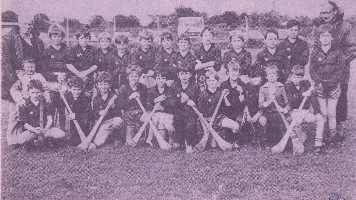
Hospital/herbertstown, who defeated Kilmallock in the South U-12, H.C. final at Knocklong. 19/6/82