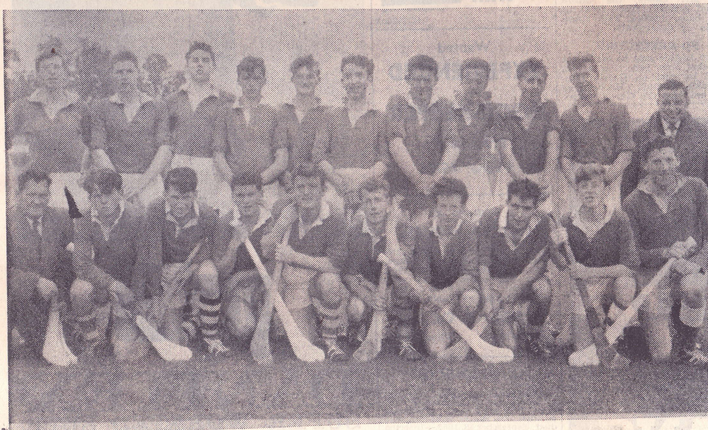
Smiles before and after . . . The Kilmallock team who swept to victory over Knockaderry in last Sunday's final of the Limerick Minor Hurling Championship. The score was 8-7 to 5-2.

Both teams fielded in green jerseys, but on the toss of a coin, Knockaderry changed to Treaty blue.