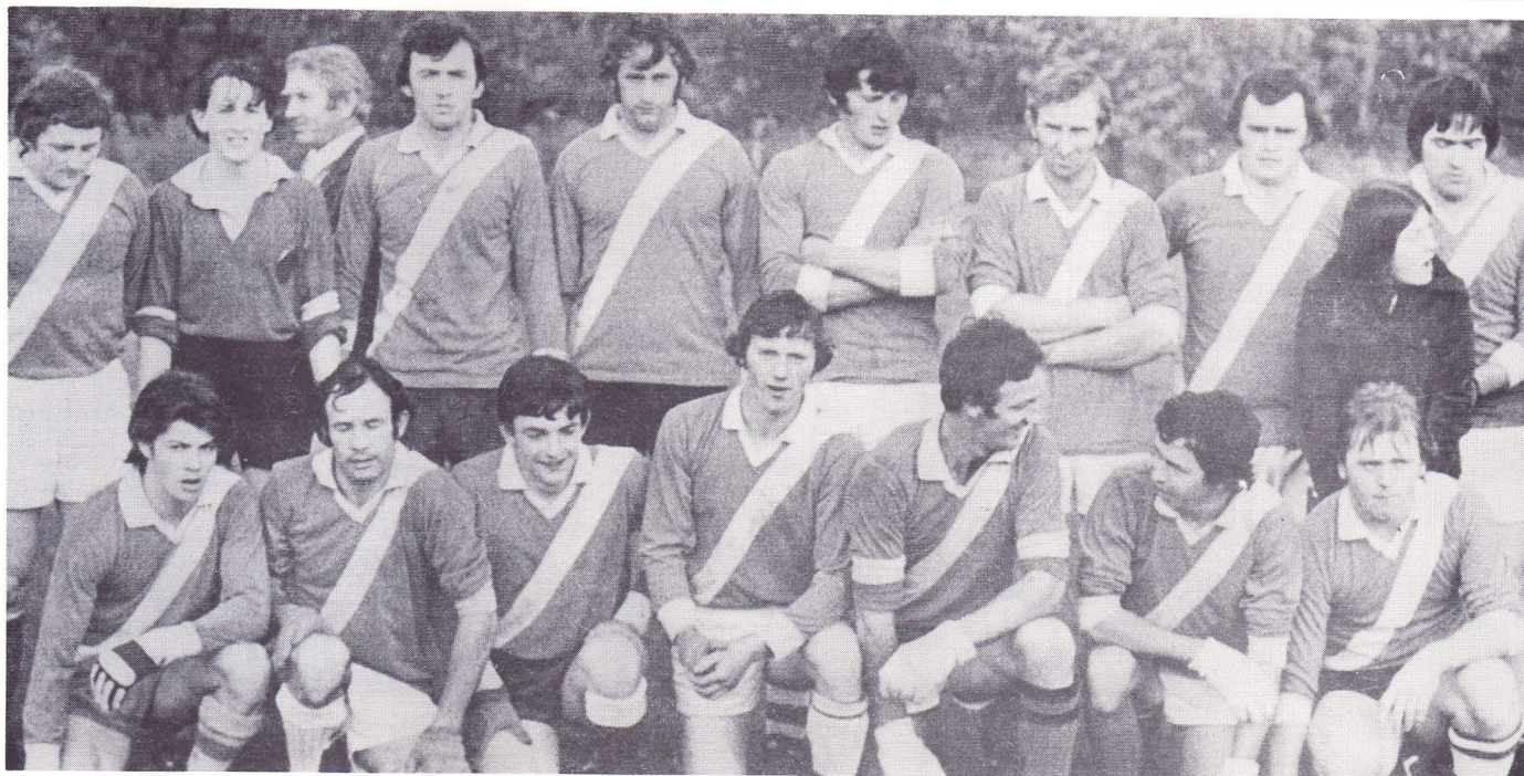
Kilteely-Dromkeen, defeated by Fedamore, in the East J.F.C. Final. 1978