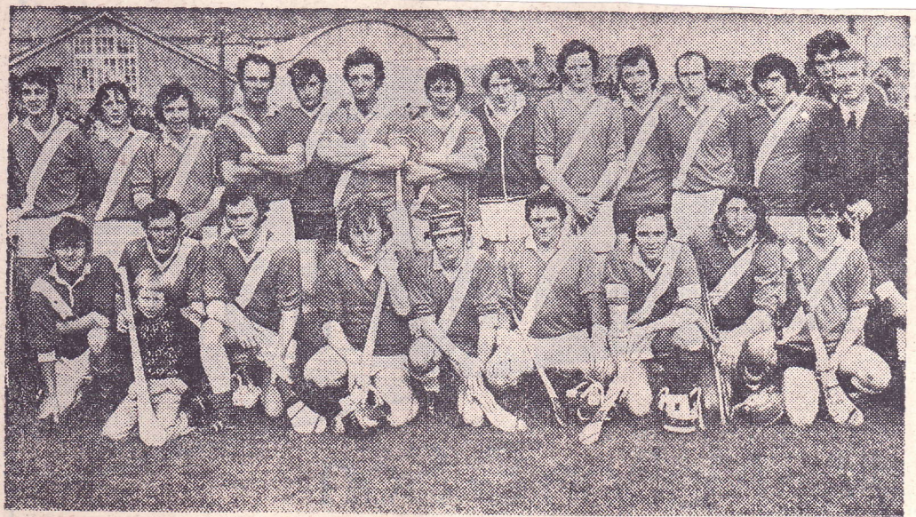
Kilteely-Dromkeen, who put up a great fight before losing to Patrickswell in the championship.