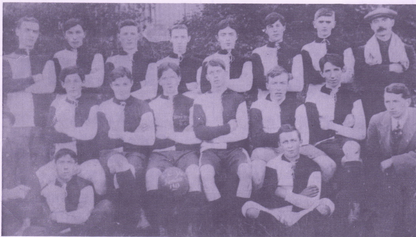
N.C.W. Senior Football Team. 1913.