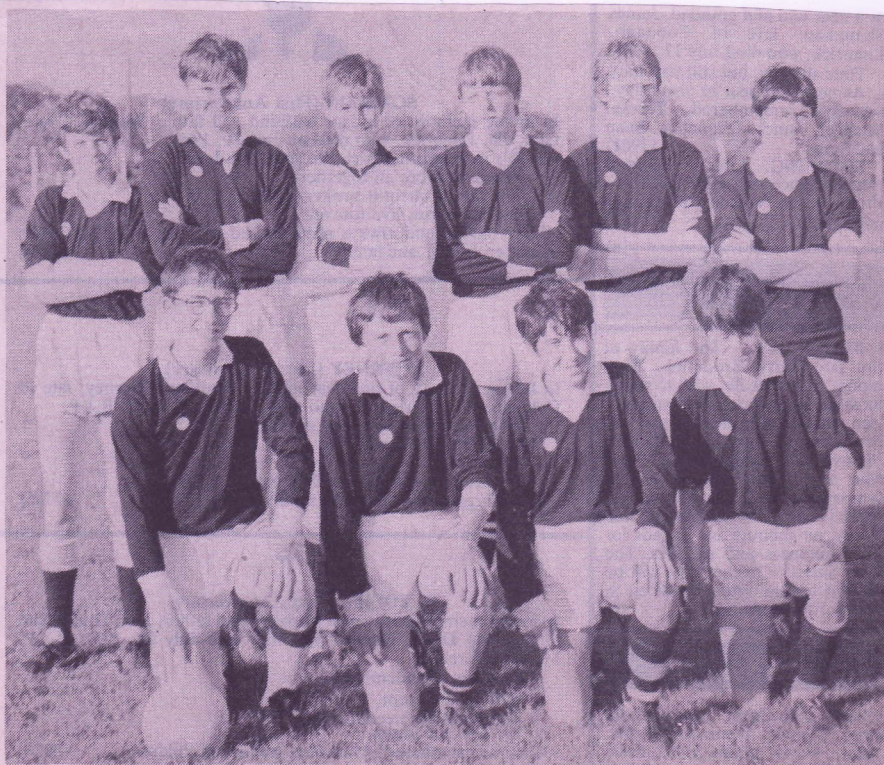
Newcastle, who beat Kilmallock in the County Ogsport final at Croom.