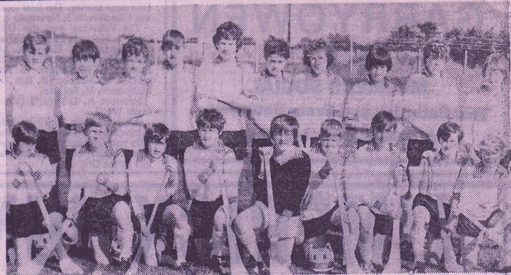
Newcastle West, who were defeated by Claughaun in the county u-14 hurling final.