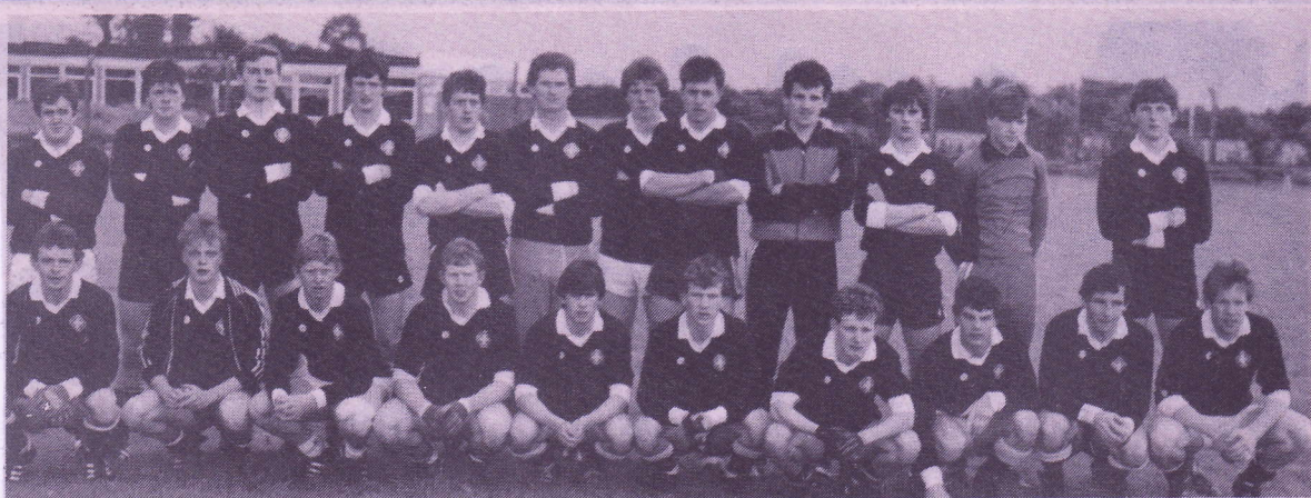
The Newcastle West team who won the under 21 football championship at Askeaton.