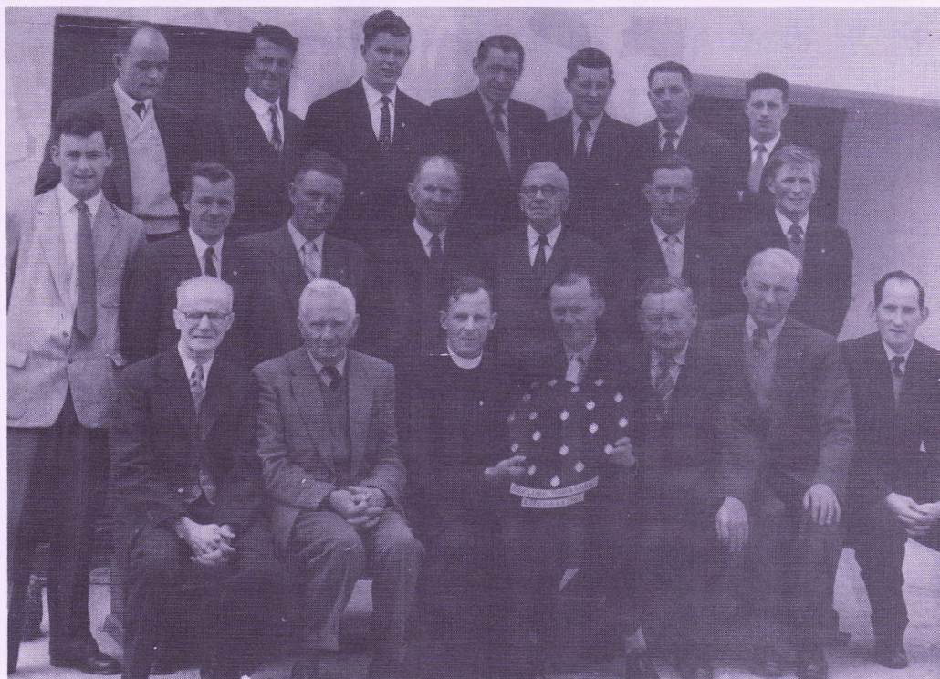
THE ORIGINAL NEWCASTLE WEST GROUNDS COMMITTEE.