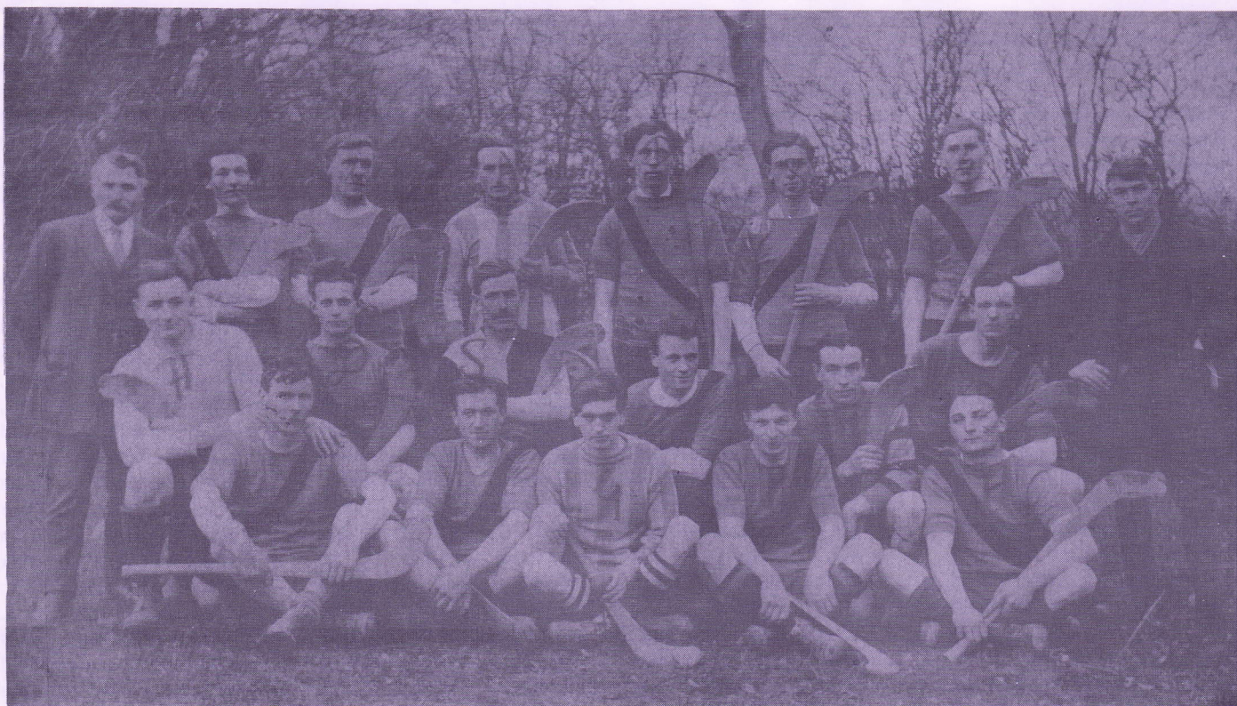
N.C.W. Hurling Team 1917.