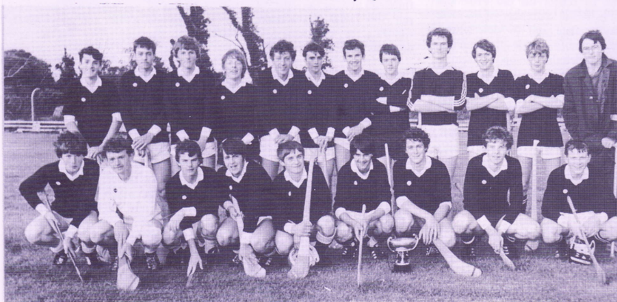
Newcastle West - Minor H. Champs.