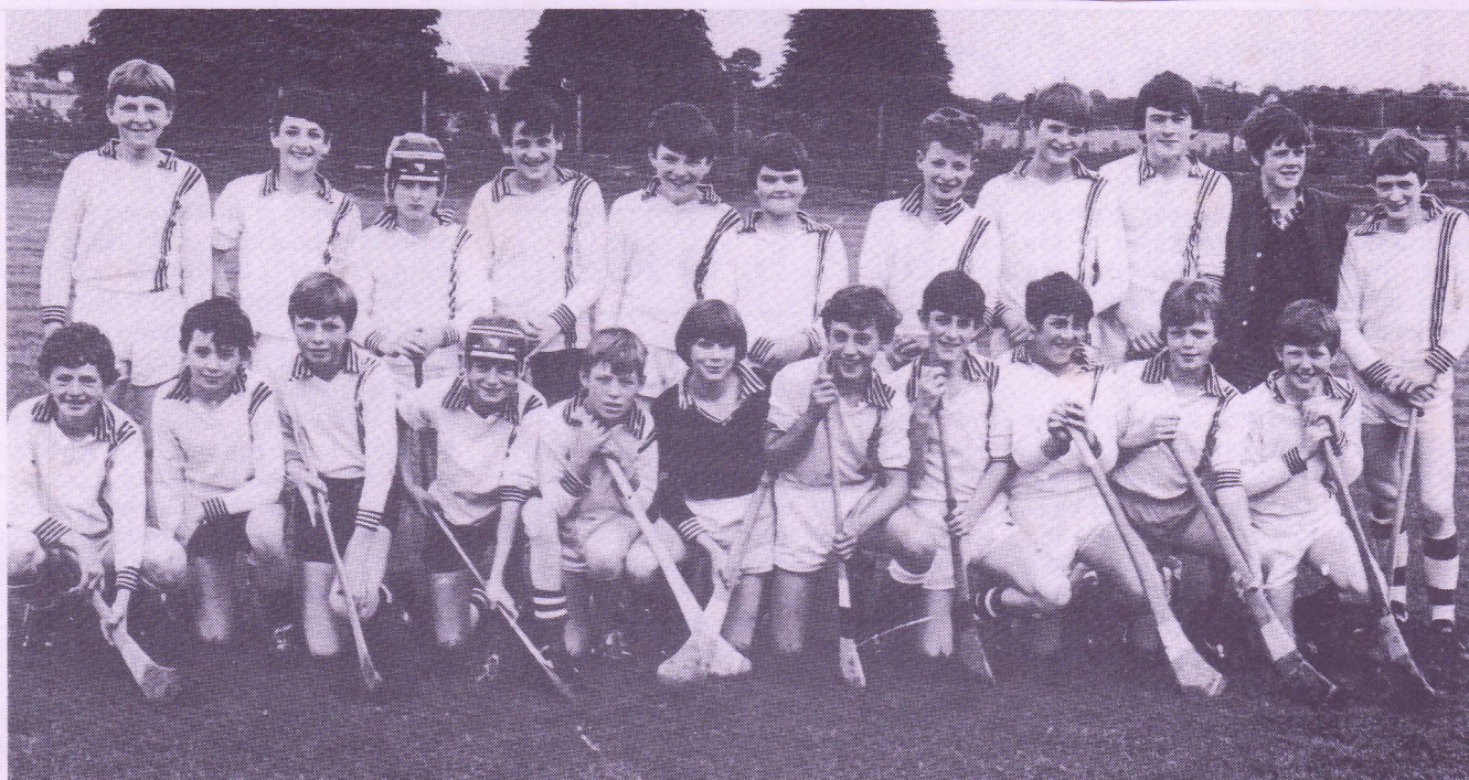
NEWCASTLEWEST UNDER-14 HURLING TEAM 1980