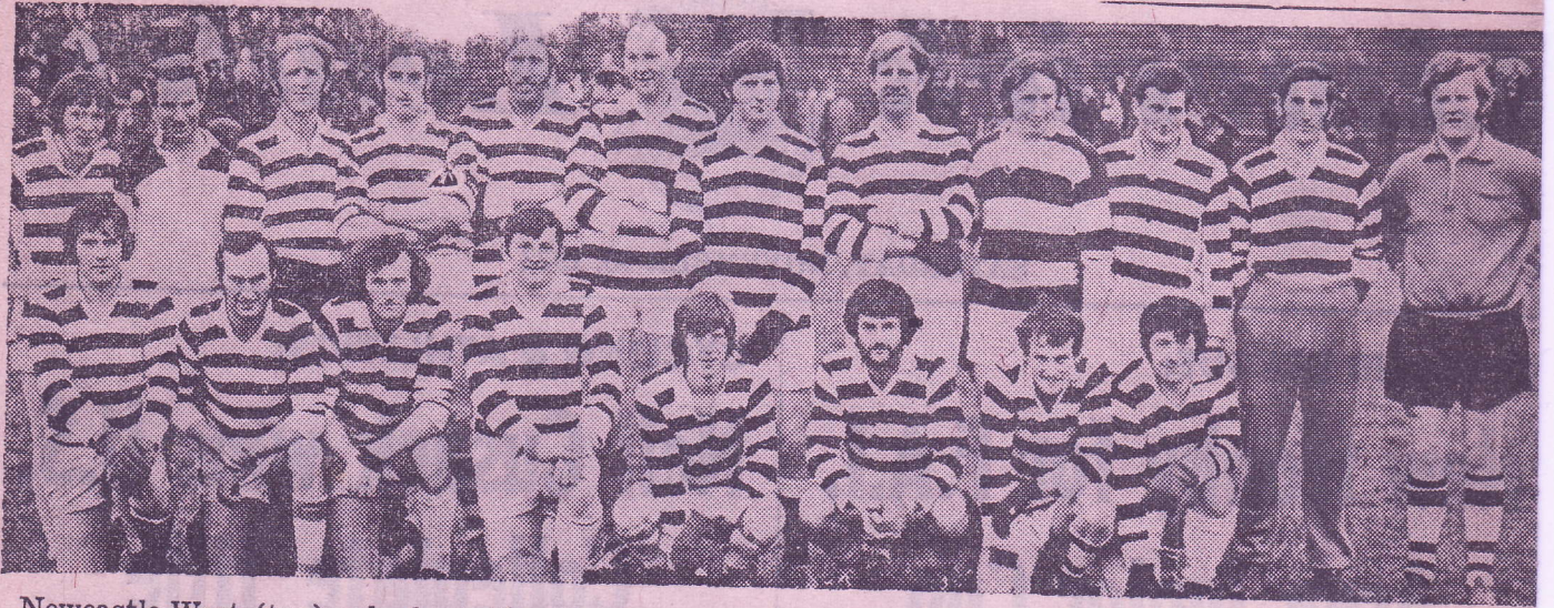
Newcastle West (top), who beat Ahane (below) in the semi-final of the County Senior football championship