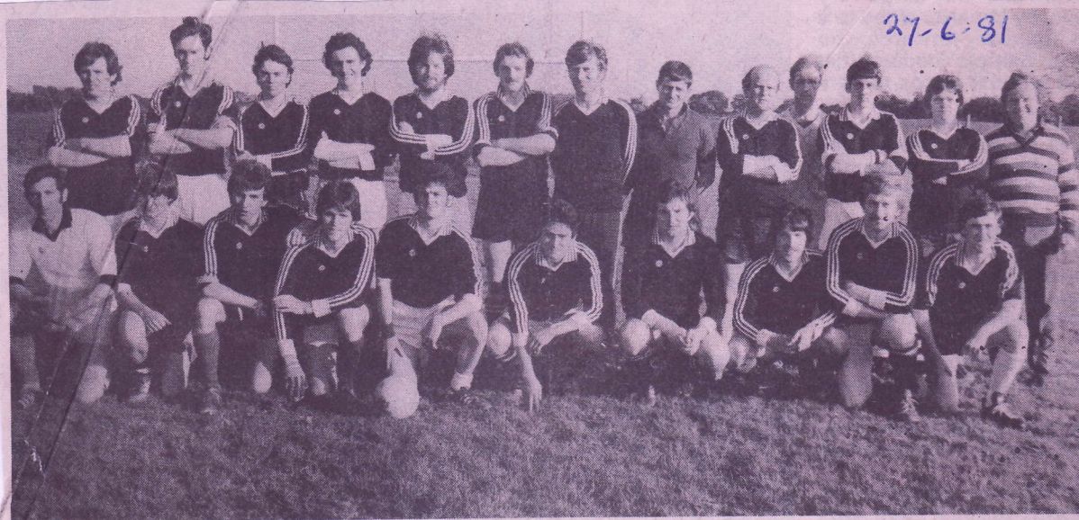
The Newcastle West team beaten by St. Kieran's in the West senior football championship.