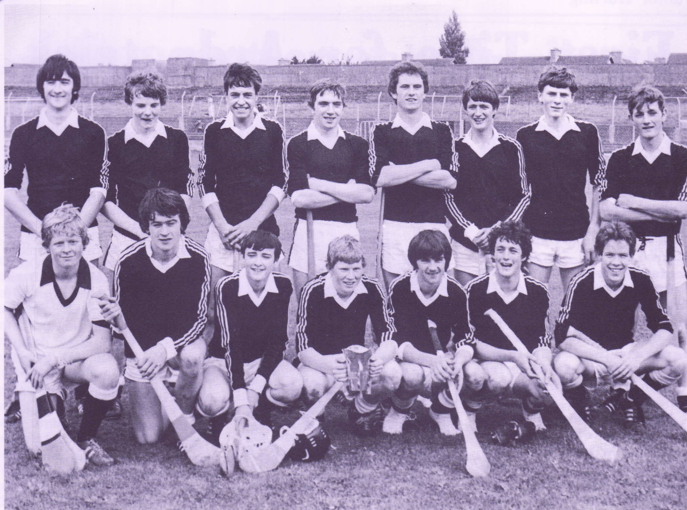
NEWCASTLE WEST MINOR HURLING TEAM — 1982 CO. CHAMPIONS