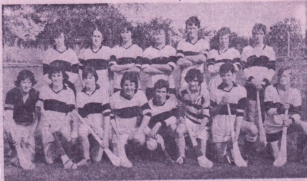
Newcastle West under 21 side that defeated Ballingarry in the under 21 championship at Askeaton.