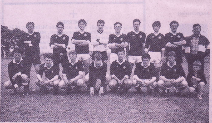
Newcastle West who defeated Askeaton in the County Senior Football Championship.