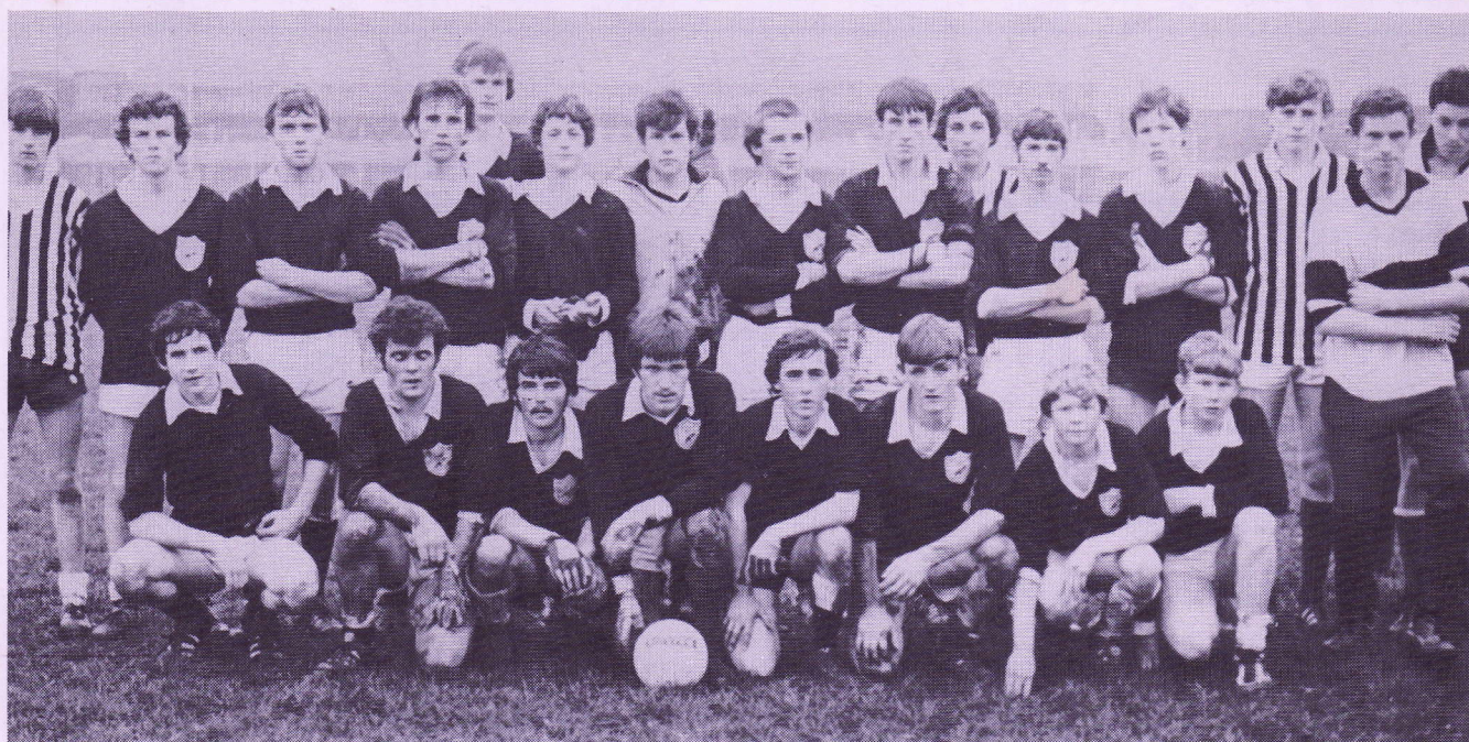
THE MINOR FOOTBALL TEAM FROM NEWCASTLEWEST — 1980 COUNTY CHAMPIONS