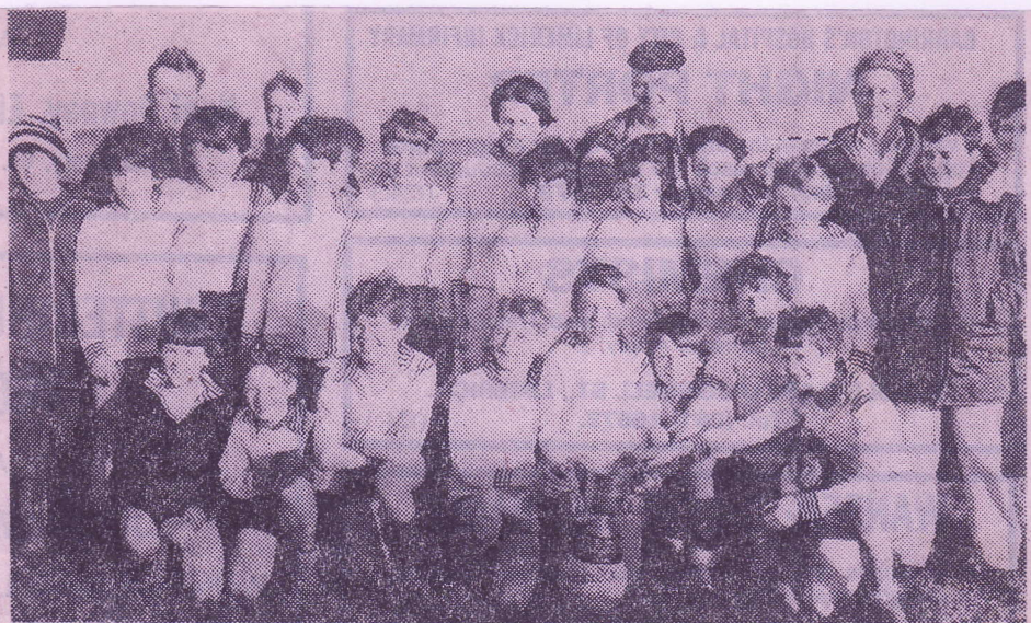
Newcastle West under 12 football finalists at Rathkeale on Sunday, when they defeated Ardagh in the West Final.