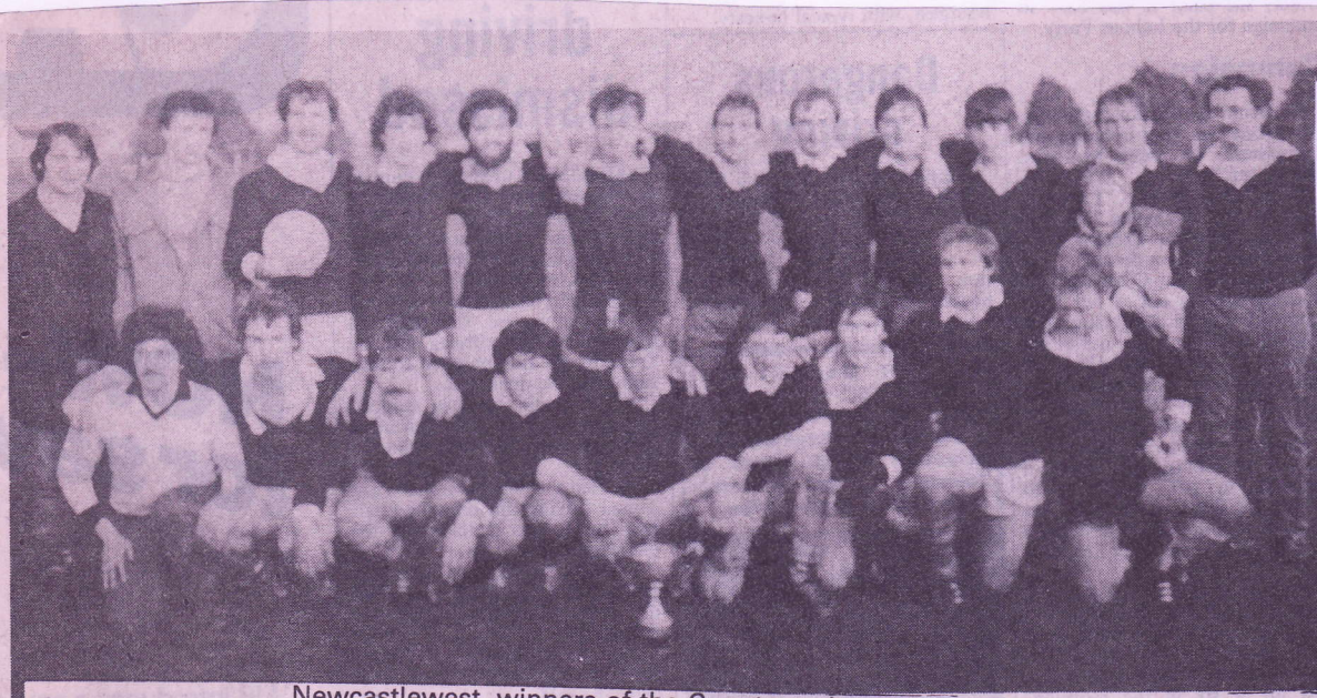
Newcastlewest, winners of the County under 16 football final.