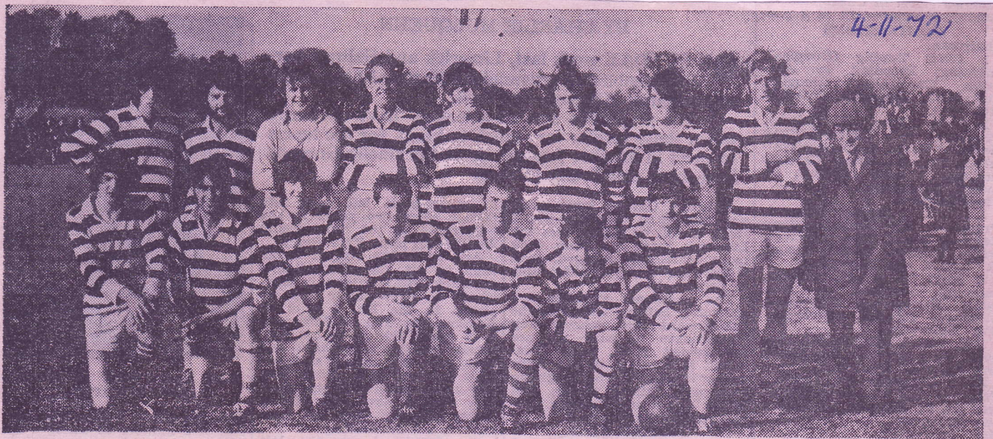
Newcastle West senior footballers who defeated Askeaton in the championship at Rathkeale, 0-9 to 1-2.