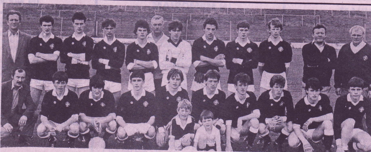
The Newcastle West team who drew with Cloughaun in the minor football final at the Gaelic Grounds.

LIMERICK LEADER, SATURDAY, OCTOBER 5, 1985