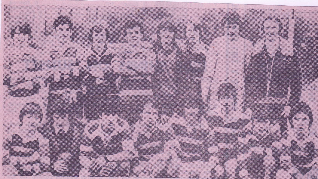
The Newcastle West Under-16 football side which will represent the Vocation School in the All-Ireland final in Croke Park tomorrow. Their opponents are St. Pius X Secondary School.