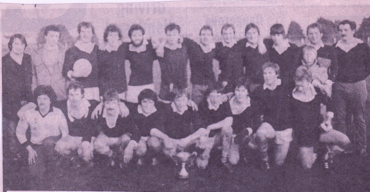
Newcastlewest, winners of the County under 16 football final.