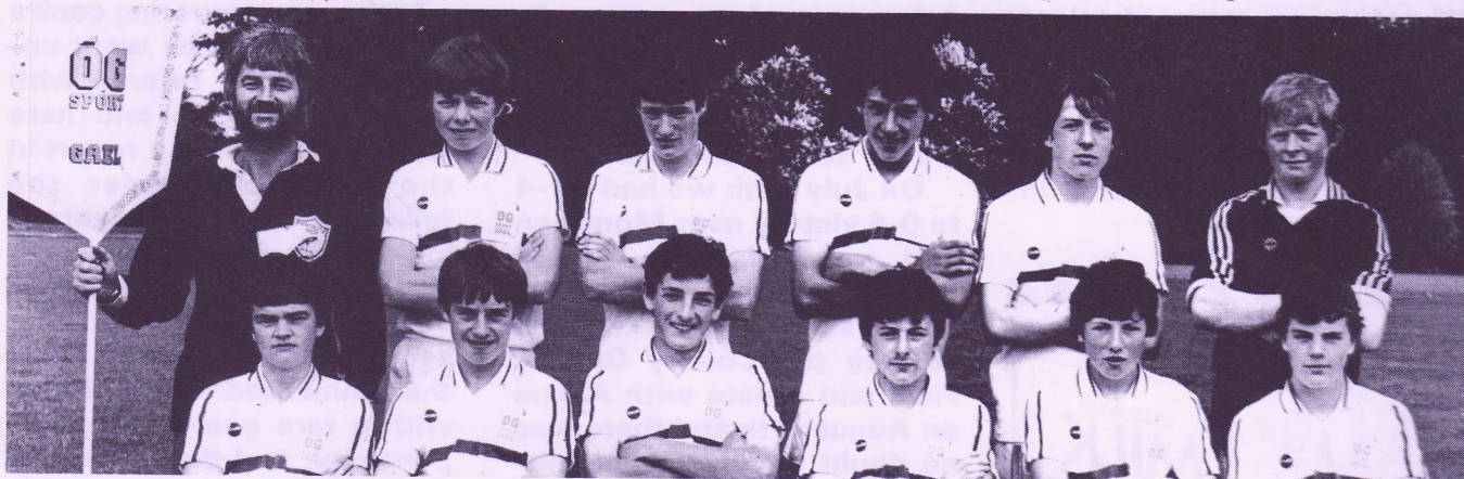
The Newcastlewest Under 15 team who represented Limerick in the All-Ireland 7-a-side Og Sport football competition at Gormanstown.