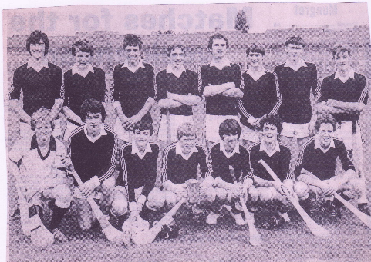
The Newcastle West minor hurling team, winners of the county championship. 13/9/82