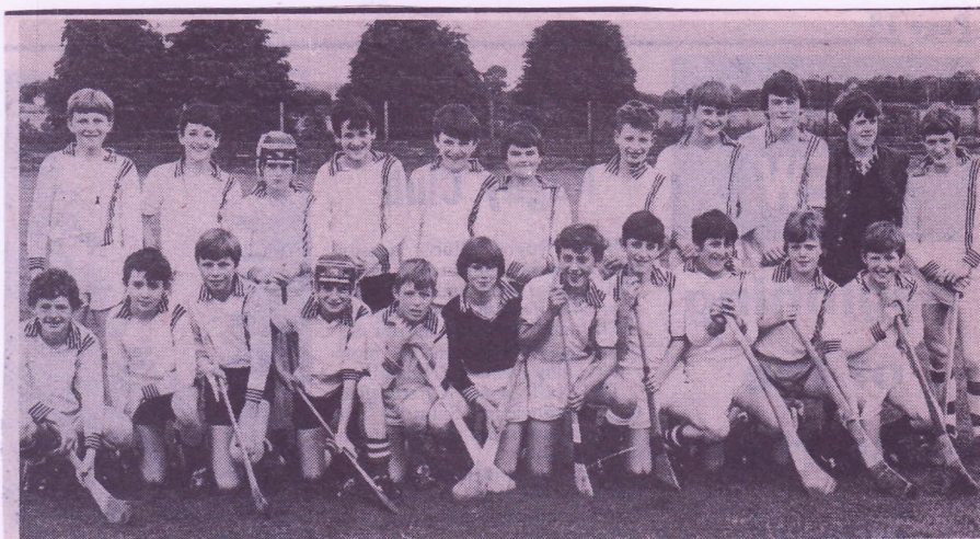
Newcastle West, who were defeated by Cloughaun in the county under-14 championship at Bruff.