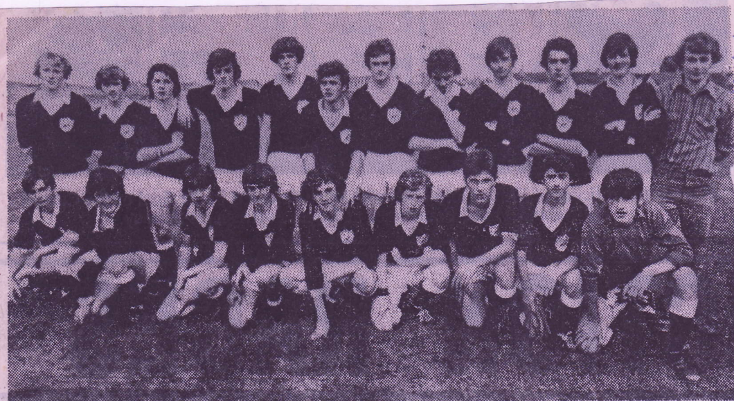
The Newcastle West team beaten by Monaleen in the county minor football final.