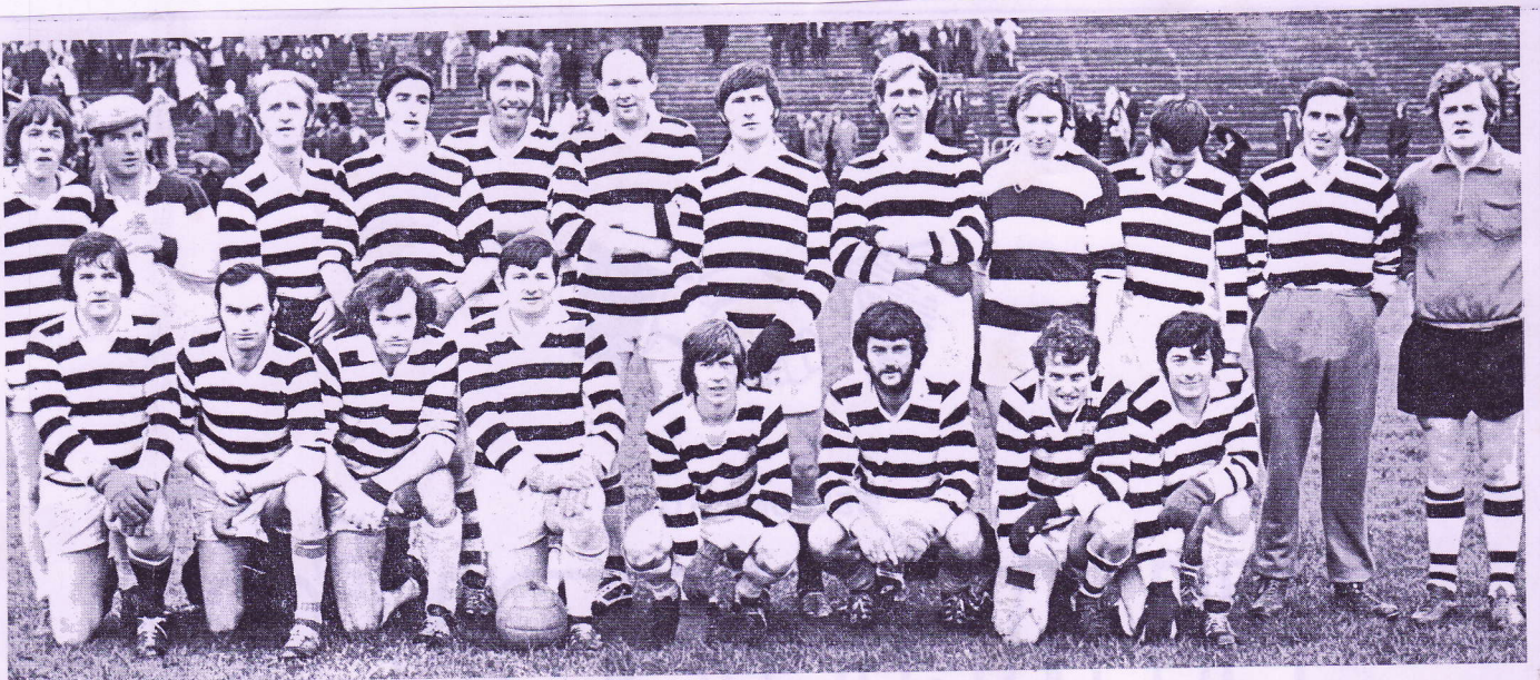
NEWCASTLE WEST SENIOR FOOTBALL TEAM—West Limerick Champions 1972