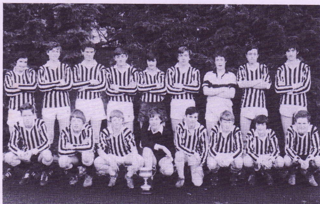
NEWCASTLEWEST UNDER-16 FOOTBALL TEAM

The minor footballers who reached their third successive County Fina, having failed to Monaleen in 1978, and St. Mary's in 1979, made it third time lucky, when they