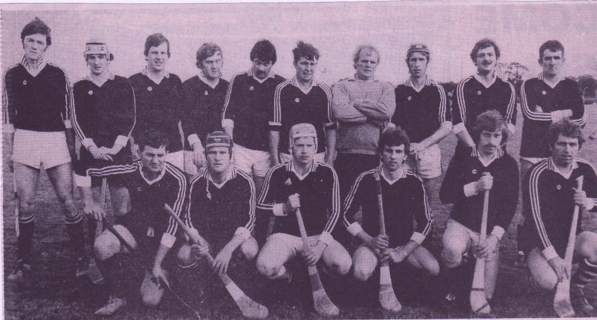
Newcastle West defeated by Adare on Saturday. 13-6-81