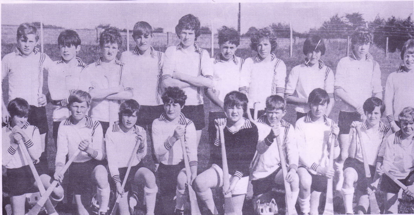
Newcastlewest, winners of the West under 14 Hurling championship, who failed narrowly to Claughaun in a thrilling County Final 1998