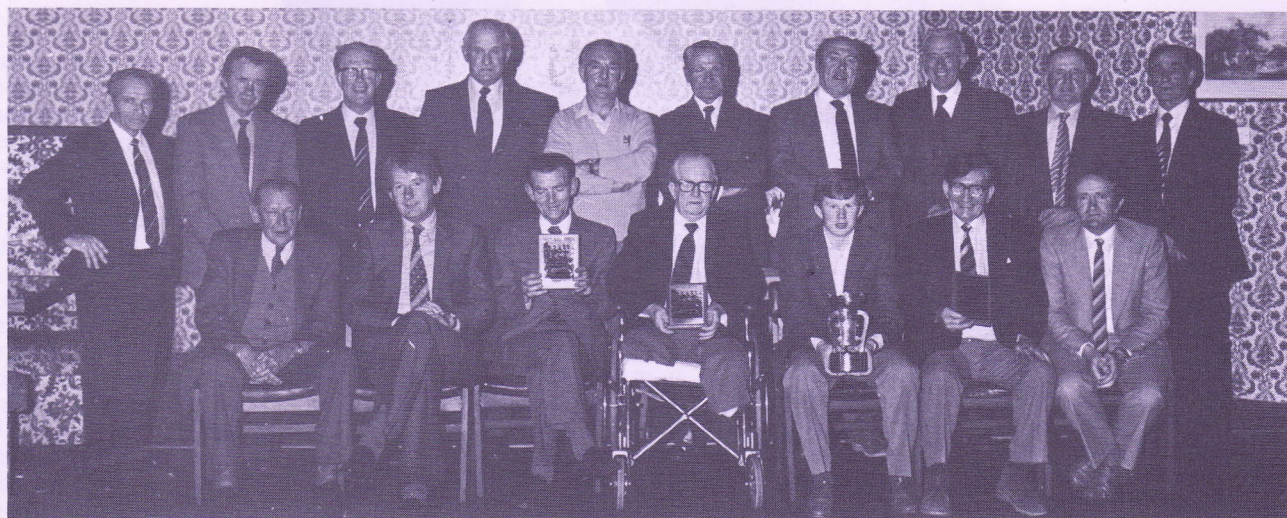
Presentation of Awards to surviving members of 1937 Newcastle West Minor Hurling County Champions

These moves seemed to do the trick as the plentiful supply of the ball