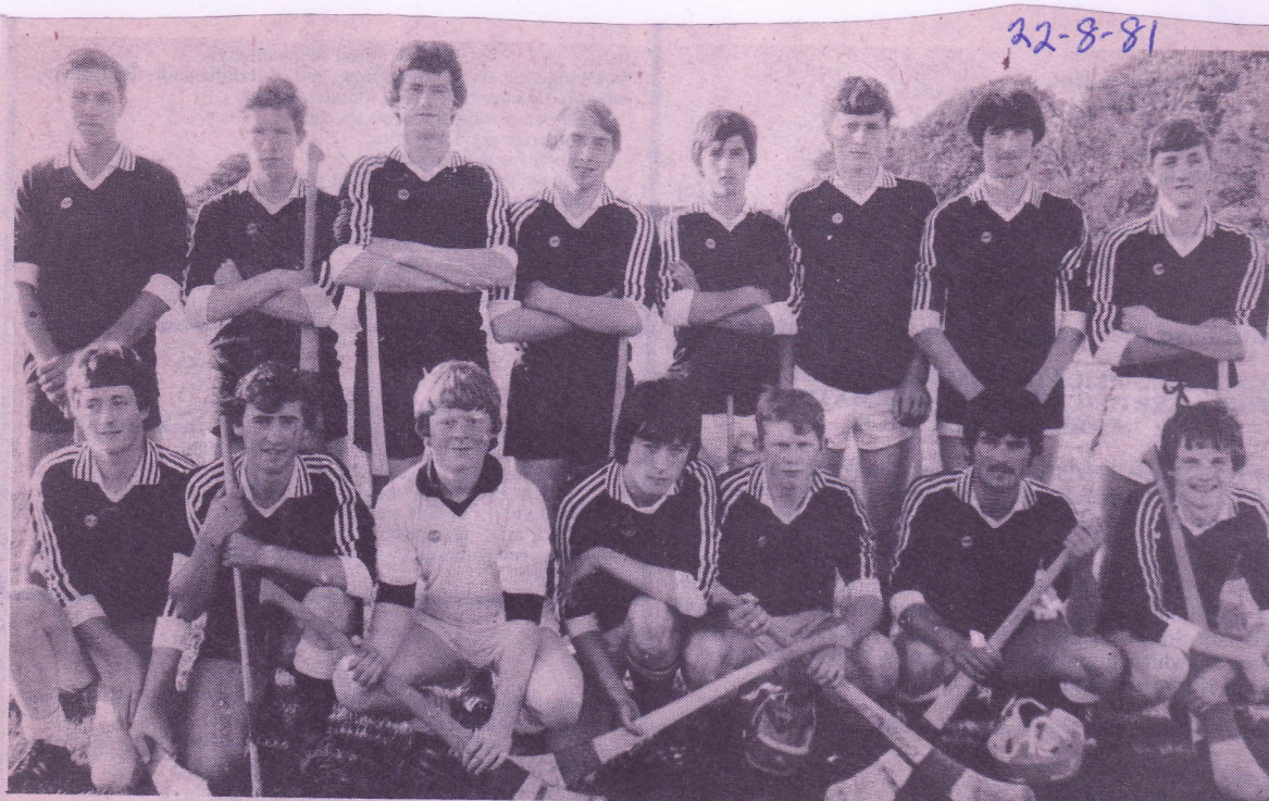
Newcastle West, who defeated Knockaderry 4-11 to 0-5 in the under 21 hurling final at Askeaton