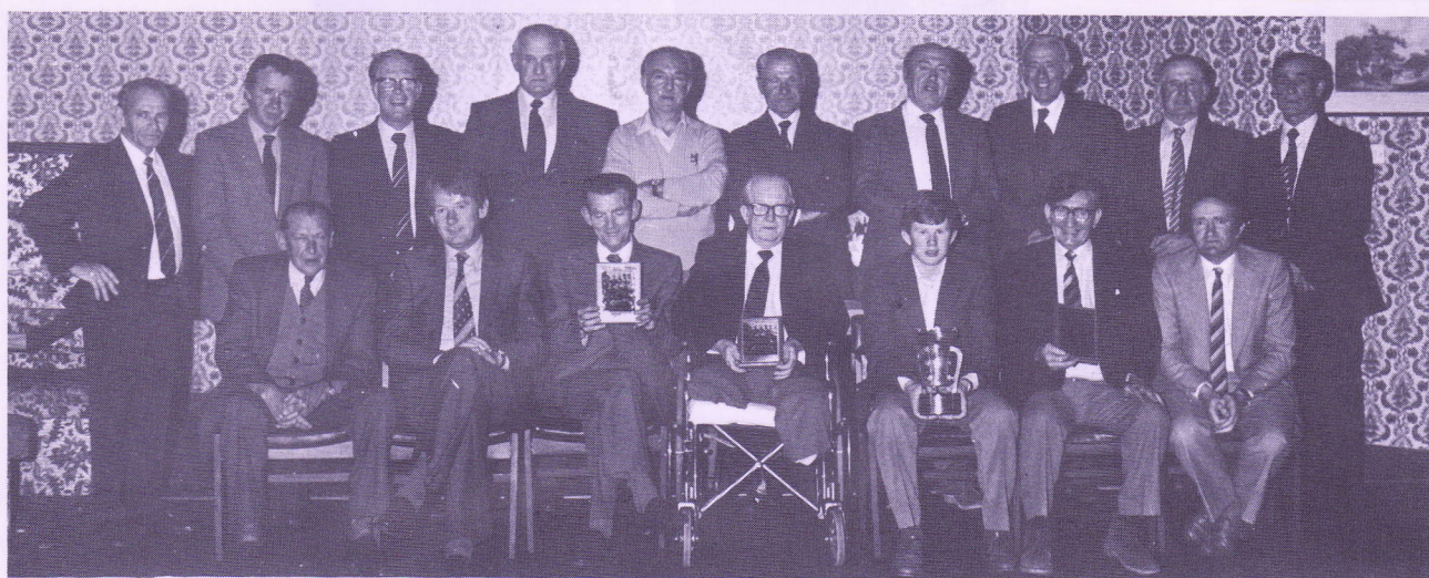
Presentation of Awards to surviving members of 1937 Newcastle West Minor Hurling County Champions