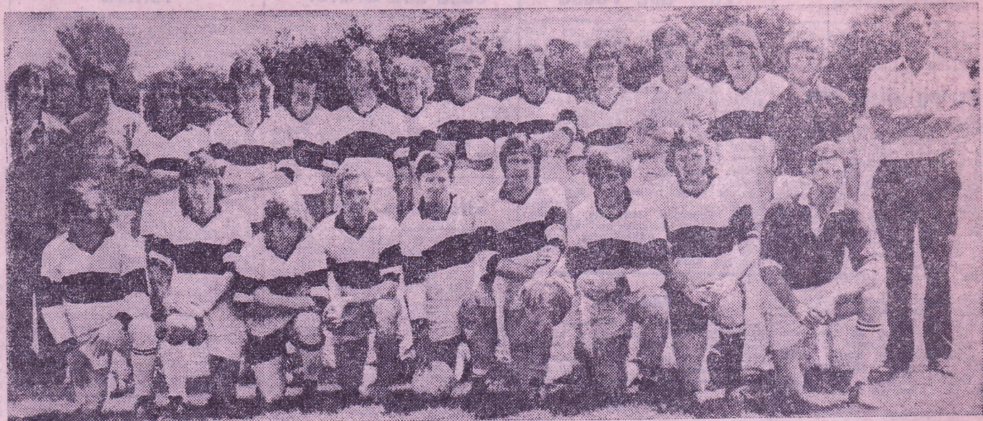
The Newcastle West team that lost to Abbeyfeale in the re-play of their senior football championship game.