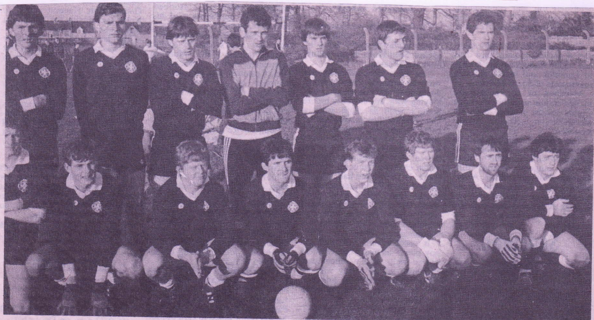
Defending Under 21 Football champions, Newcastle West, who played a draw with South Liberties in the final last Sunday. The replay takes place on Sunday.

The final is fixed for Askeaton with a starting time of 2.30 p.m.