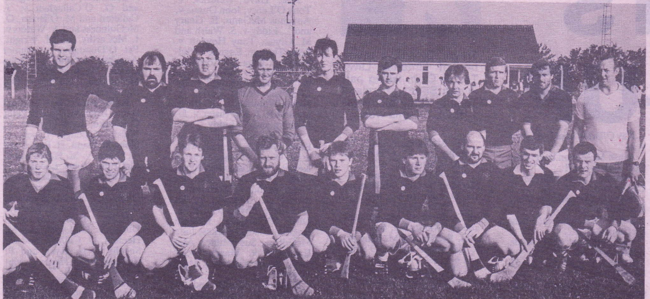
The Old Christians team who drew with Fedamore in the county senior hurling championship.