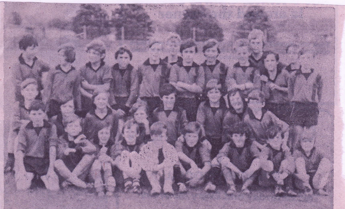
Old Christians County under-12 football champions.