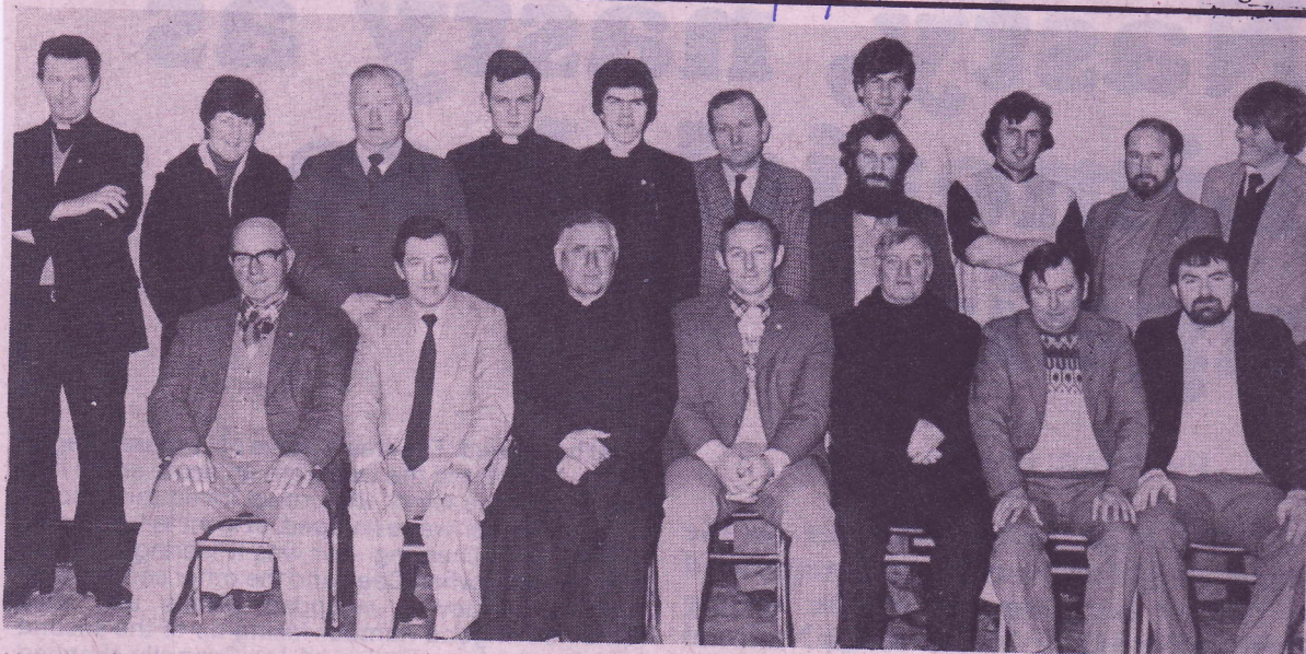
Group pictured at the Old Christians' G.A.A. Club annual general meeting at Sexton Street C.B.S.