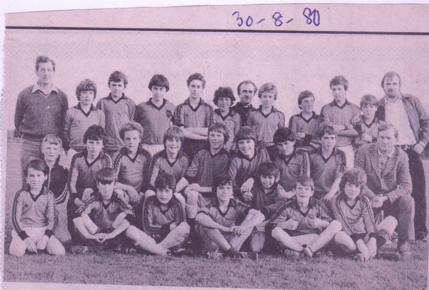
Old Christians, winners of the county under 14 football title.