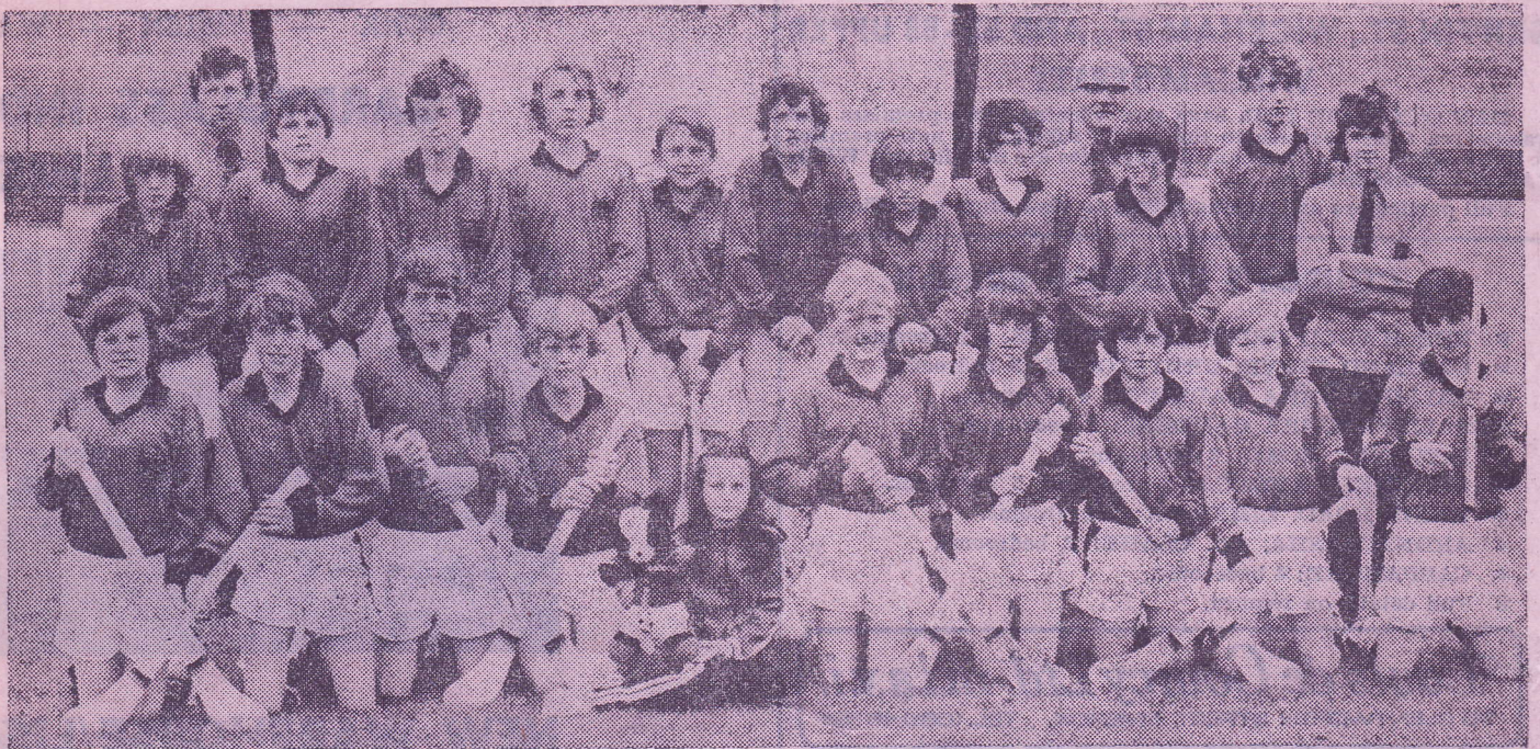
Old Christians "Feile na nGael" team that won the city and county under 14 hurling championships recently. They defeated Adare in the final in Bruff by 3-5 to 1-1.