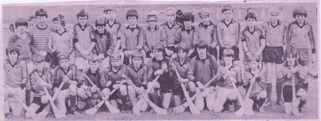
Old Christians, who beat Ballybrown in the Feile na nGael final. June 1980