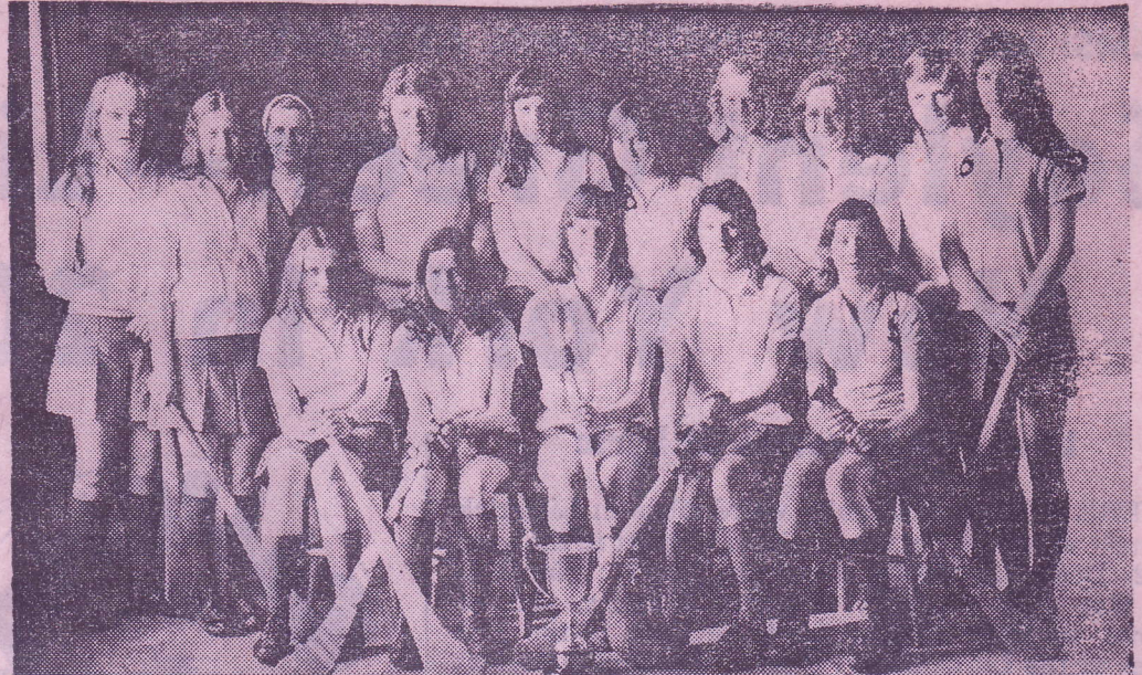
Munster Champions . . . the Rosary Hill, Castleconnell, team which won the Munster Colleges senior championship final at their first attempt last Saturday. They meet the Ulster champions in the All-Ireland Colleges semi-final on this Saturday at Castleconnell.