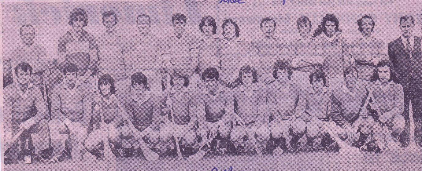
the final of the East Hurling Championship.