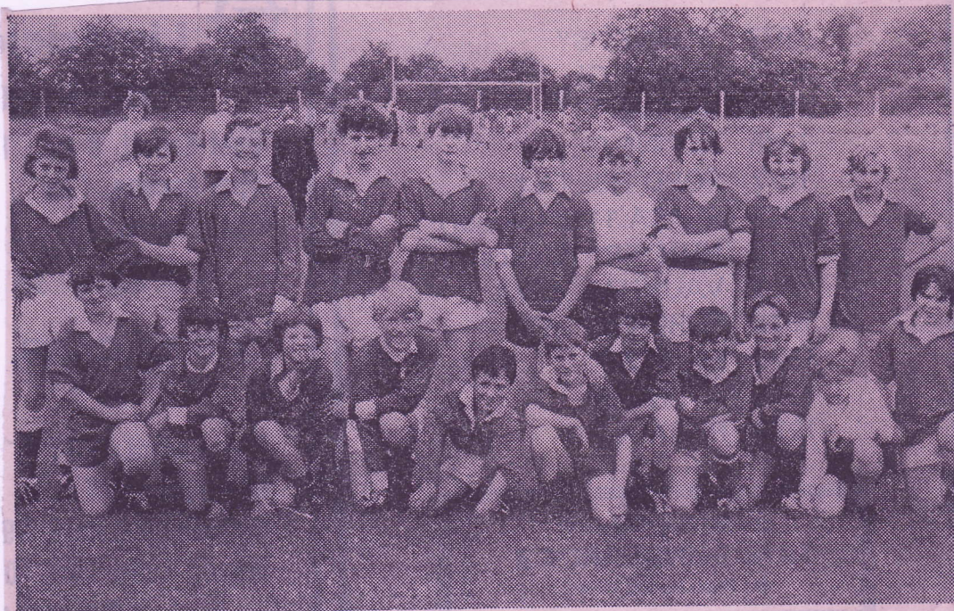
Oola, who lost to South Liberties in the East under 14 F.C. final.