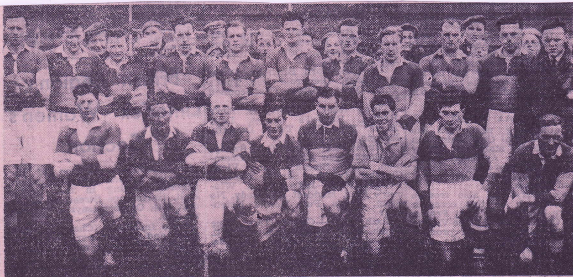
Top photograph is of the Treaty Sarsfields team that defeated Pallas in the County Senior Football Final at Limerick Gaelic Grounds on Sunday. The second group is of the Pallas team.

Finally a vote of thanks was passed for the help and assistance given by everyone in making last year such a success.