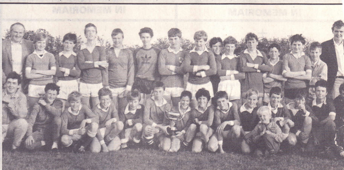
The St. Patrick's team who won the county under 14 football championship.

MERICK LEADER, SATURDAY, AUGUST 10, 1985