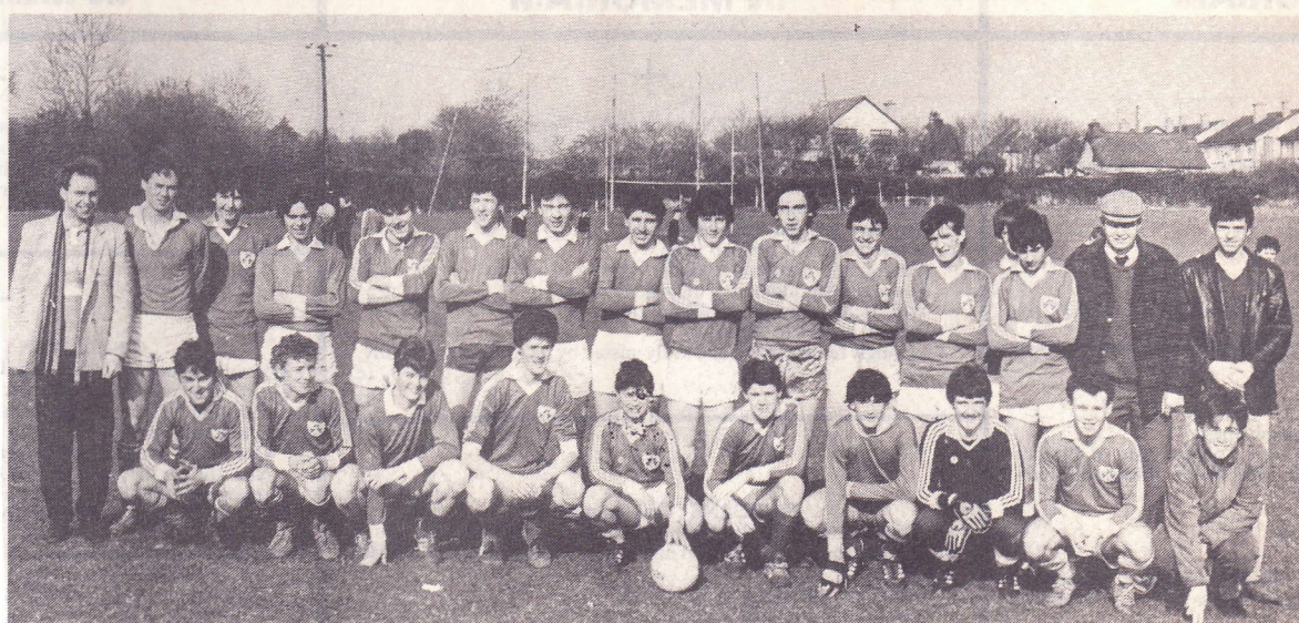
The St. Patrick's Minor Gaelic Football team who defeated Ballinacurra Gaels, 3-4 to 1-4, in the Kevin Hartigan Memorial Cup match.