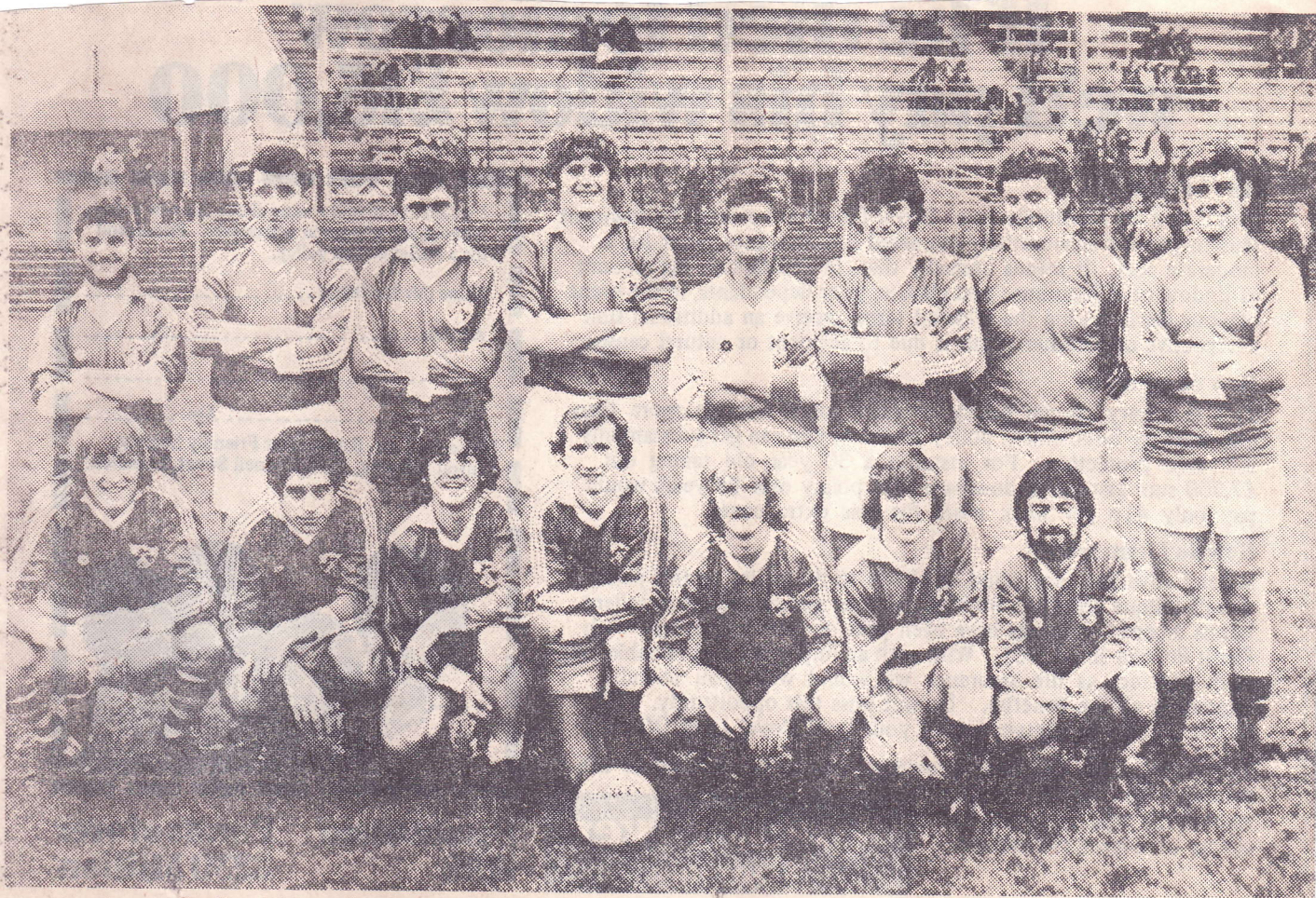
St. Patrick's, who were beaten by Lansdowne Rovers in the city junior football final