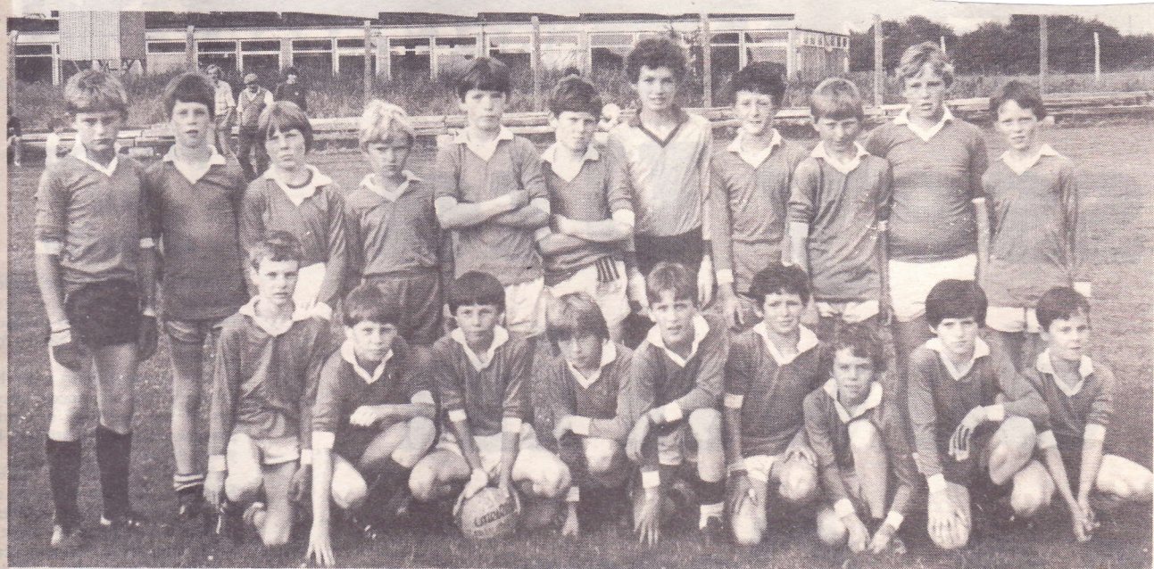
The St. Patrick's team who retained the county under 12 football championship at Askeaton on Thursday

20. LIMERICK CHRONICLE, TUESDAY, JULY 26, 1983