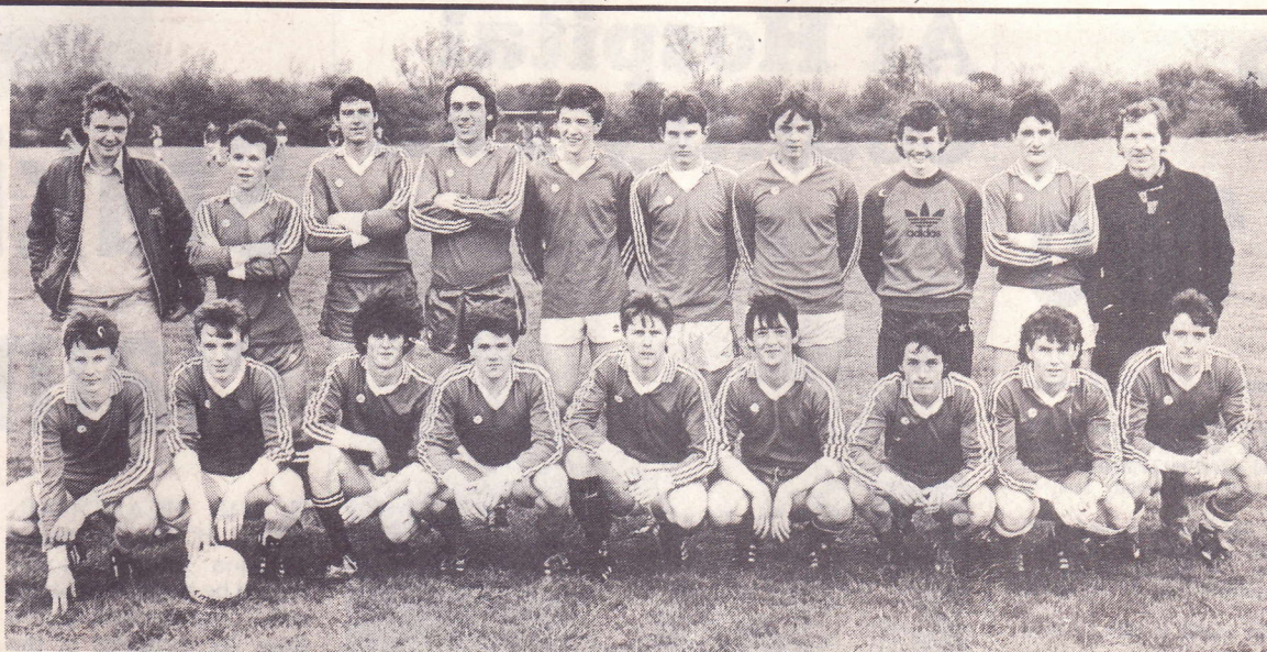
The St. Patrick's team who beat Mungret in the under 21 football league.