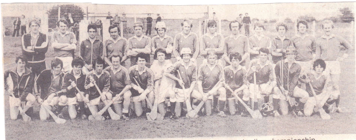
20/9/80 Tournafulla, who were beaten by Patrickswell in the county hurling championship.