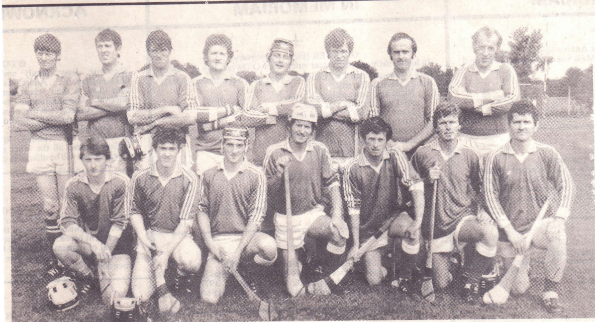
The Tournafulla team that beat Granagh in the senior hurling tie last Sunday.

LIMERICK LEADER, SATURDAY, SEPTEMBER 3, 1983