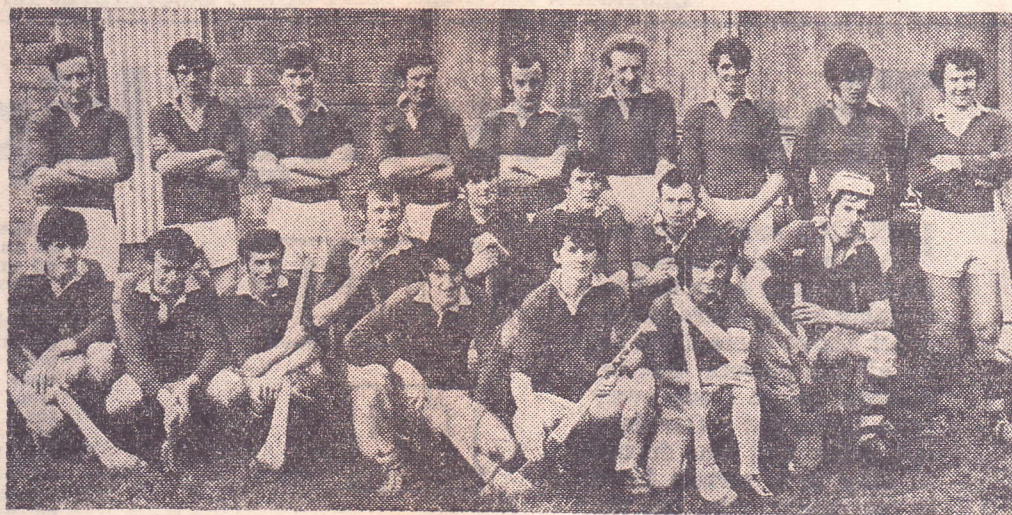
The Tournafulla team which won the West Limerick Junior Hurling championships in 1970 and again this season.

LIMERICK LEADER, SATURDAY, DECEMBER 18, 1971