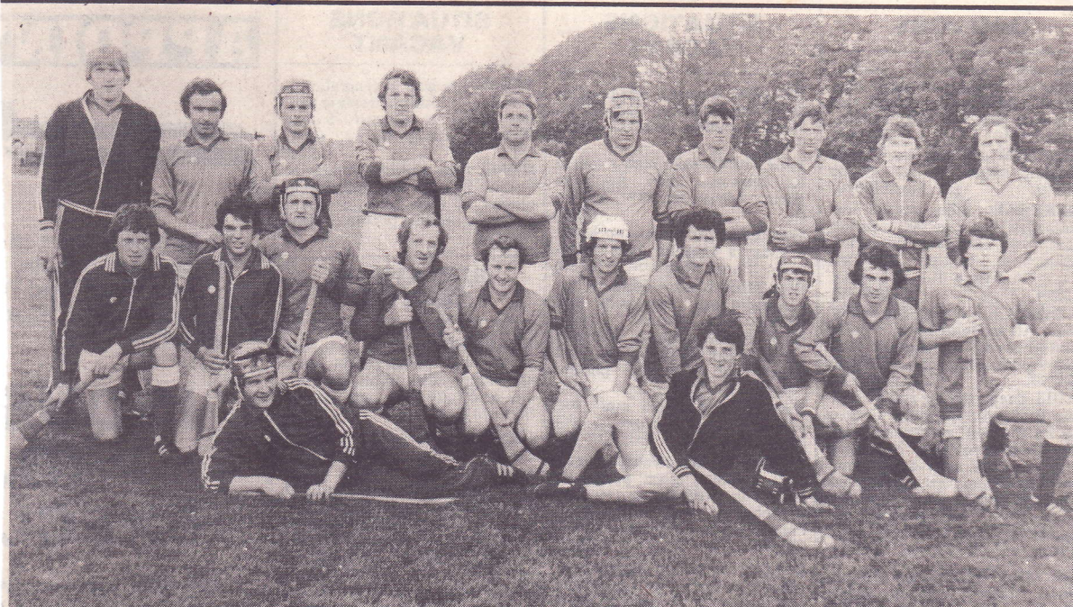
The Tournafulla team, top, who beat Ballygarry, below, in the West senior hurling semi-final.