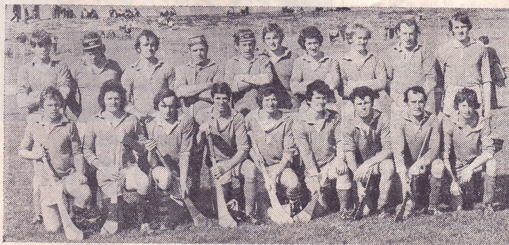
SH 12-9-77 Successful — Tournafulla.