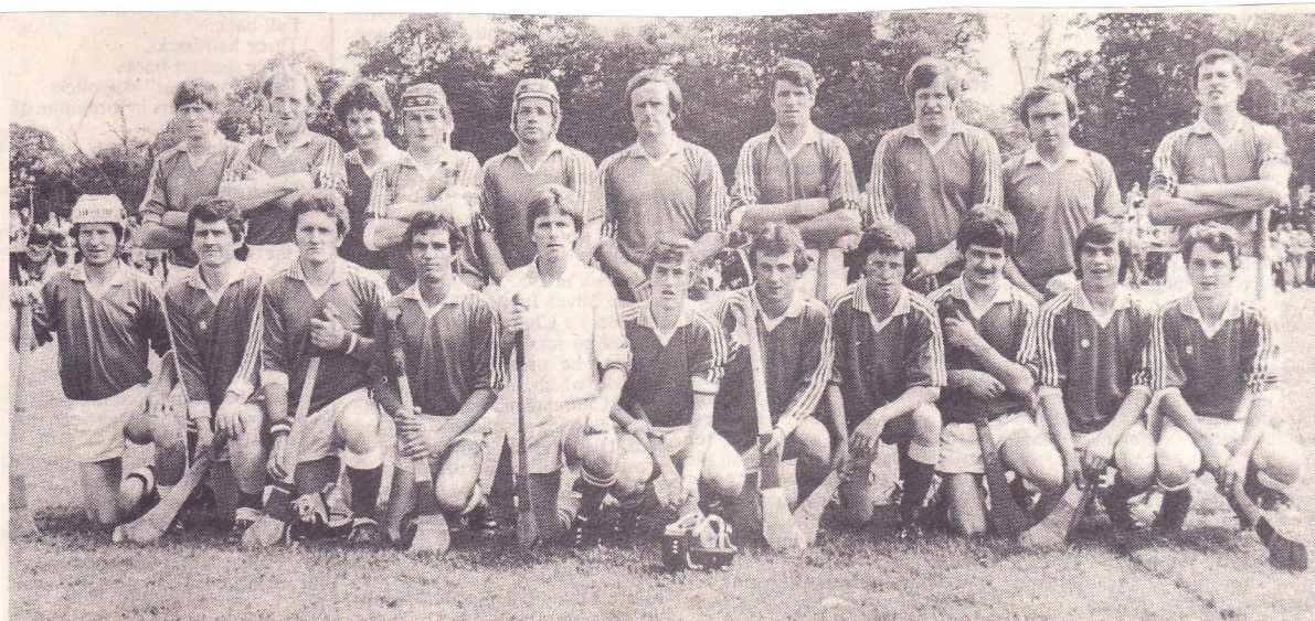
Tournafulla, who were defeated by Adare in the West senior hurling final at N.C.W. 31-7-82