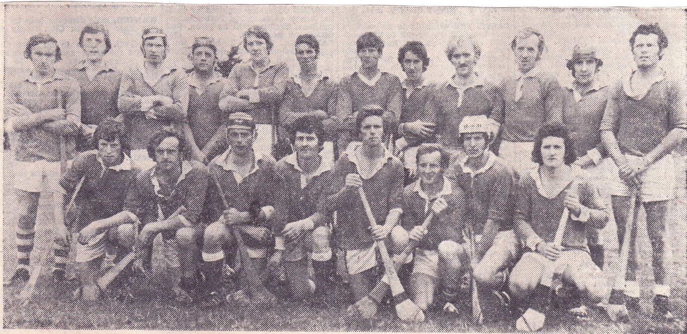
The Tour senior side that lost to Kileedy at Newcastle West on Sunday, 3/9/77