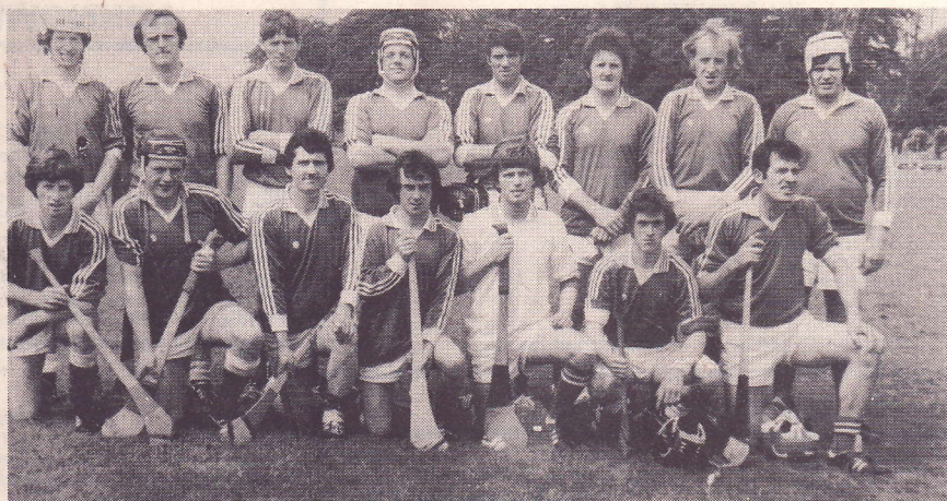
The Tournafulla team which surprised Kileedy in the West Limerick S.H. Championship at Askeaton.

LIMERICK LEADER, SATURDAY, JULY 18, 1981