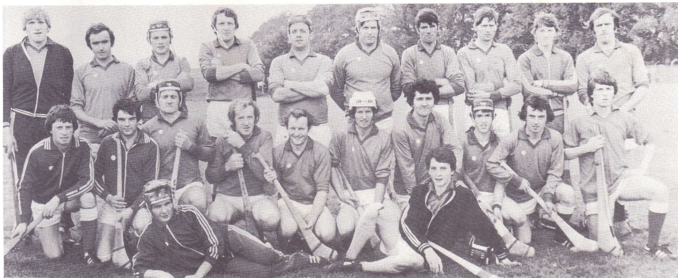
TOURNAFULLA SENIOR HURLERS. 1980