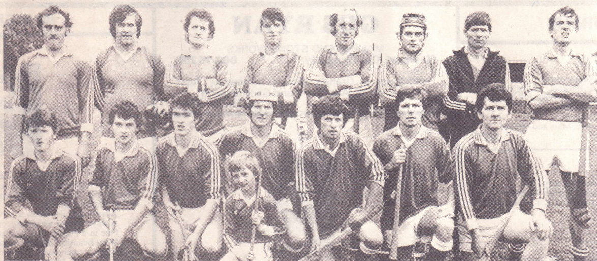
Tour, who defeated Feohanagh 1-13 to 2-8 in the West senior hurling final at Newcastle West on Sunday.