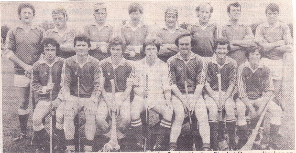
Tournafulla, who defeated Granagh, 2-9 to 1-5 in the Senior Hurling Final at Dromcollogher on Sunday. 15-8-81