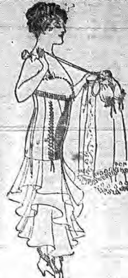
MODEL 640 The improved maternity model. A real hygienic garment. Size 22 to 30 ins. White coutil. Price 13/11