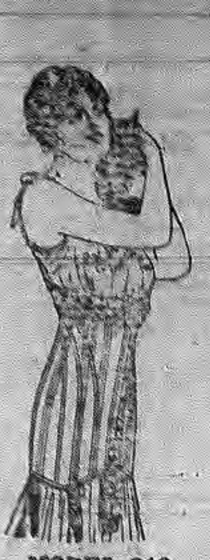
MODEL 646 Wonderful value in this season's newest style. Gives the correct silhouette. Incorrupt wash. Average figure. Size 19 to 30 ins. White coutil. Price 13/11

Remember—Royal Worcester Corsets give you personality as well as fashion.