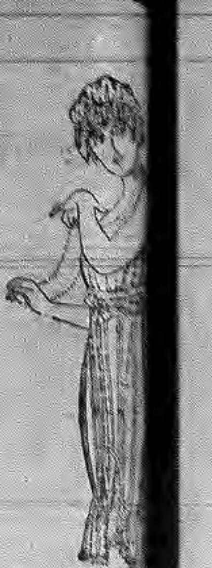
MODEL 8822 This smart model is distinctive and comfortable. Six hose supporters. Size 22 to 30 ins. Price 23/6

MODEL 863. Low bust. Average figure. In fancy and durable fabric. White or Pink. 20 to 30 ins. Price, 21/9. MODEL 894. Charming new Autumn Model. Elastic insert at hips. White Broché. 20 to 30 ins. Price, 29/6. MODEL 817. Very chic new "Sports" and "Dancing" corset. In Green Tulle. 19 to 28 ins. Price, 14/11. Three Charming Royal Worcester Models.