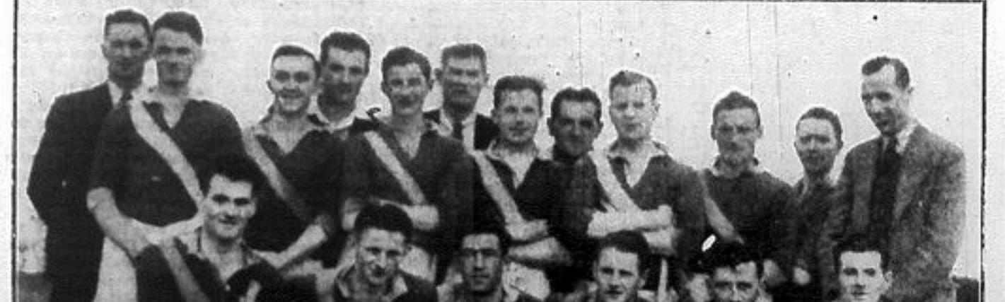
The Rathkeale team, having had a very successful season, qualified to meet Ahane in the final. They went down with colours flying.