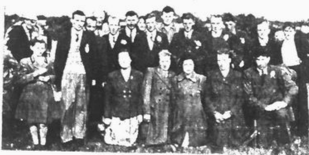
The Committee of Kilmeedy Gaelic League, shown above, held a very successful Aeriocht at Kilmeedy on Sunday last. Reports of the day's proceedings will be found in another portion of this issue.