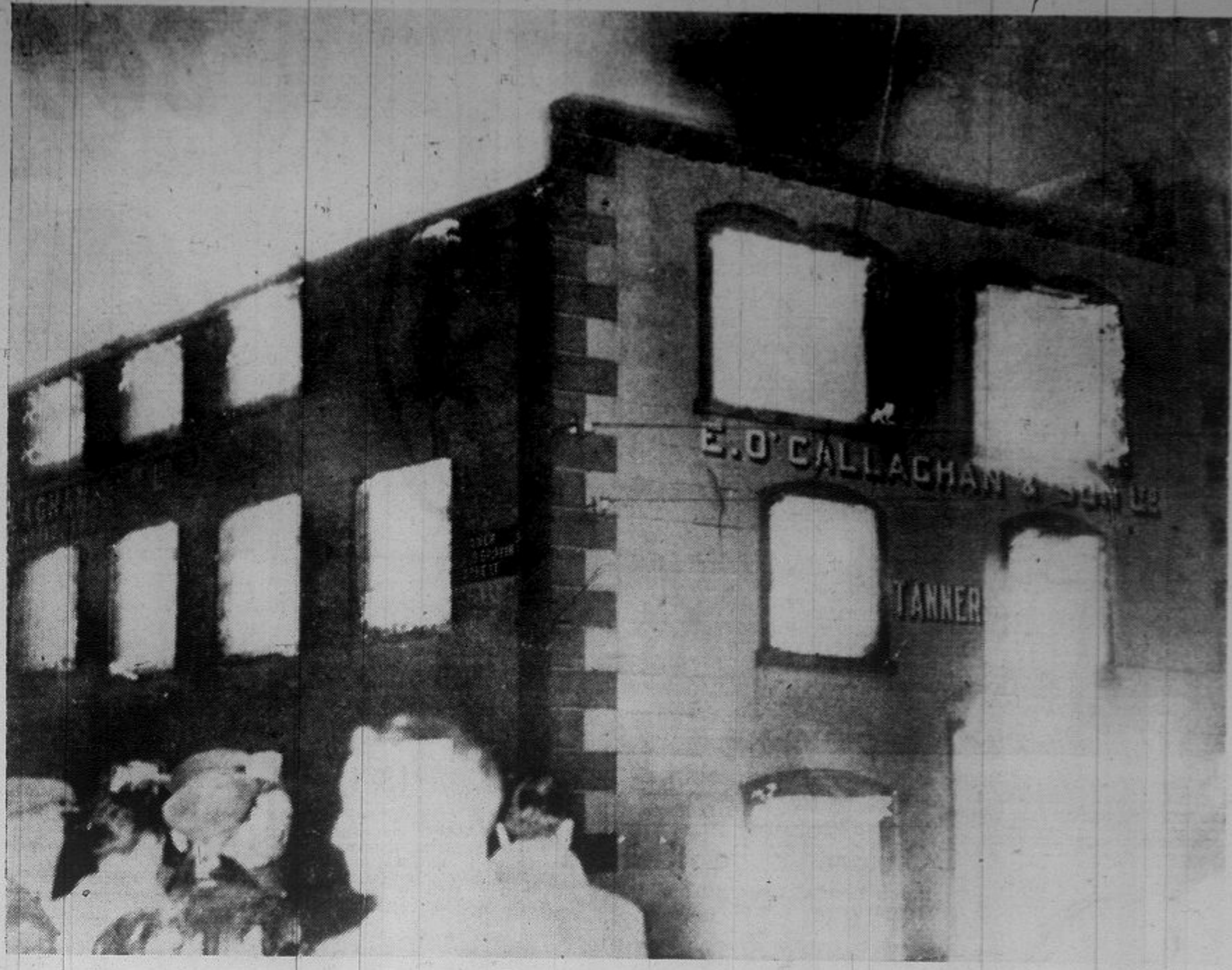
This picture of the fire which destroyed O'Callaghan's Tannery, Limerick, was taken at midnight on Wednesday.